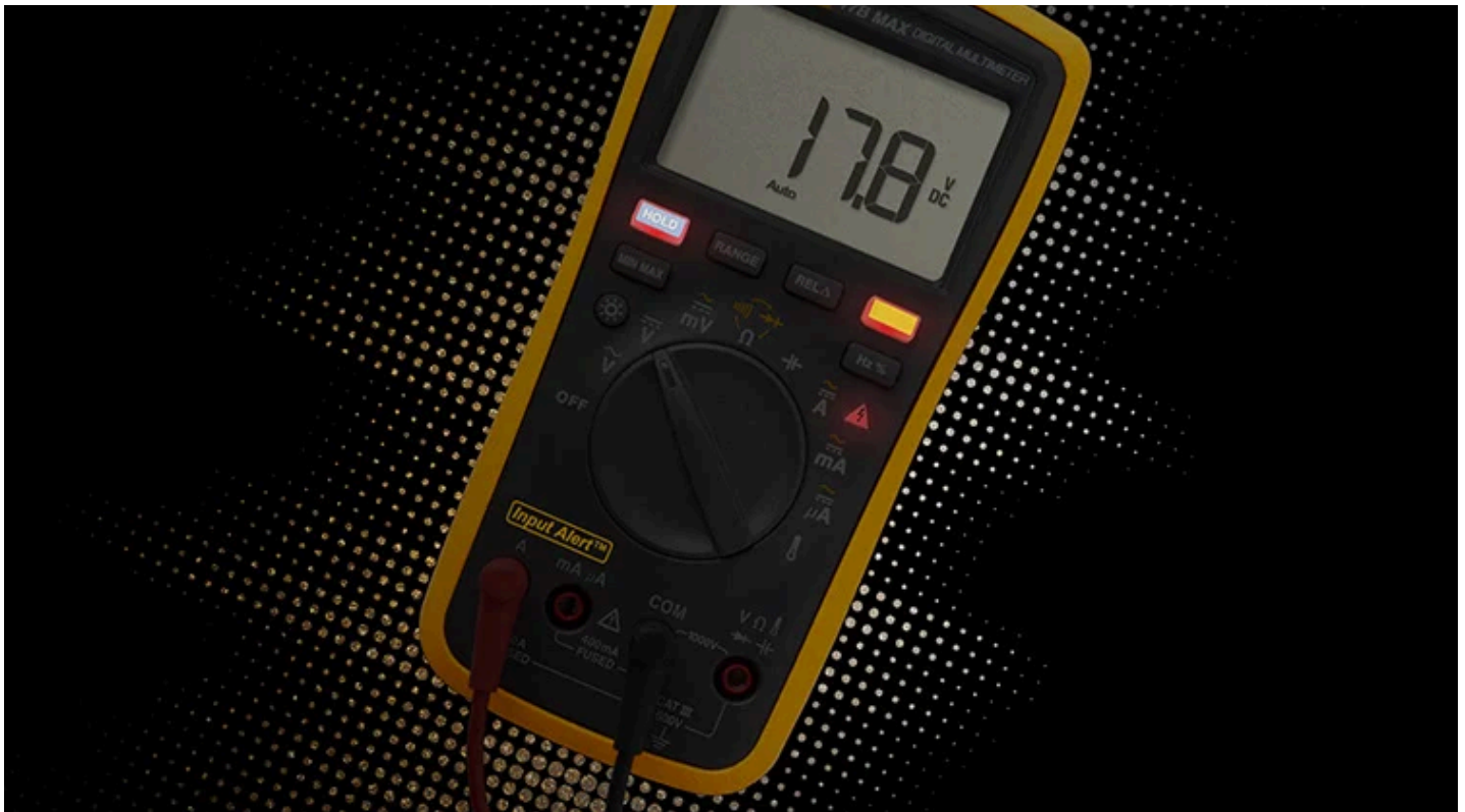
Audible and visual alarm for incorrect connections