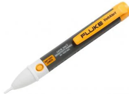
Fluke 2AC Non-Contact Voltage Tester