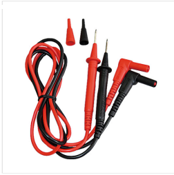
TEST LEADS MODEL 7066A