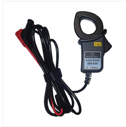
CLAMP SENSORS / ADAPTOR KEW 8161