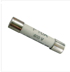
FUSE MODEL 8919