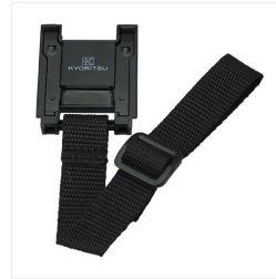
OTHERS MODEL 9189