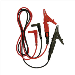
TEST LEADS MODEL 7234