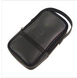
CASE MODEL 9097