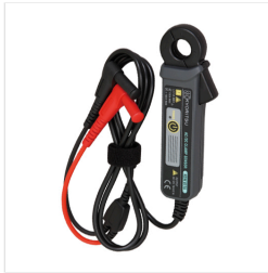
CLAMP SENSORS / ADAPTOR KEW 8115