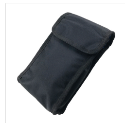
CASE MODEL 9147