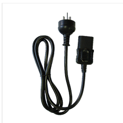
OTHERS MODEL 7123