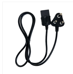
OTHERS MODEL 7126