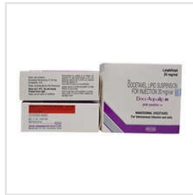
20 MG Docetaxel Lipid Suspension For