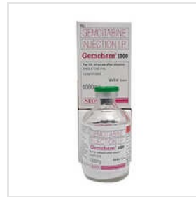
1000 MG Gemcitabine Injection IP