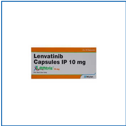
10 MG LENVATINIB CAPSULES IP

0.1 MG Triptorelin Acetate Injection, 0.5 MG Dactinomycin For Injection USP, 10 MG Lenvatinib Capsules IP, 10 MG Milrinone Lactate Injection, 10 MG Mitomycin Injection IP, 10 ML Cytarabine Injection BP, 100 MG Acalabrutinib Capsules, 100 MG Paclitaxel (Protein-bound Particles) For Injectable Suspension, 100 MG Paclitaxel Lipid Suspension For Injection, etc.