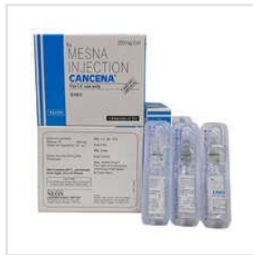
200 MG Mesna Injection