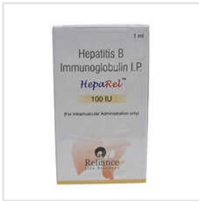
Hepatitis B Immunoglobulin IP