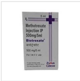
500 MG Methotrexate Injection IP