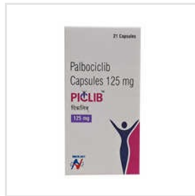
125 MG Palbo-Ciclib Capsules