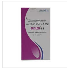
0.5 MG Dactinomycin For Injection USP