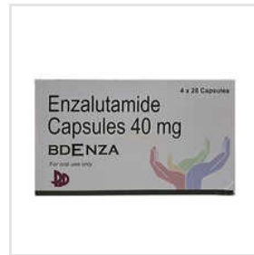
40 MG Enzalutamide Capsules