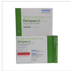
0.1 MG Triptorelin Acetate Injection