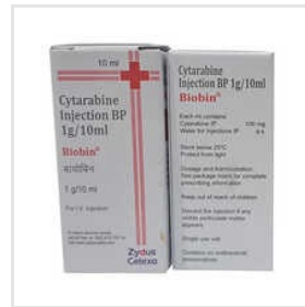
10 ML Cytarabine Injection BP