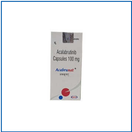
100 MG ACALABRUTINIB CAPSULES