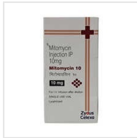
10 MG Mitomycin Injection IP