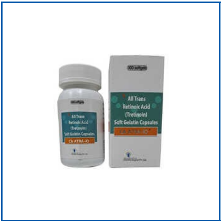
ALL TRANS RETINOIC ACID (TRETINOIN) SOFT GELATIN CAPSULES