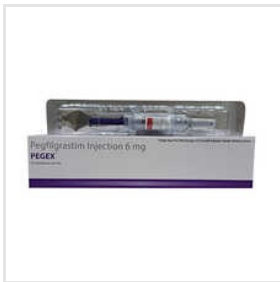
6 MG Pegfilgrastim Injection