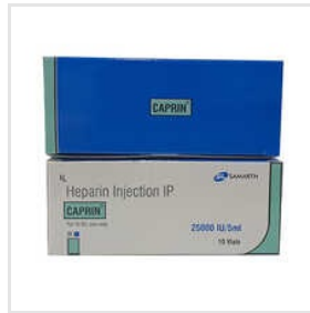
Heparin Injection IP 25000 IU