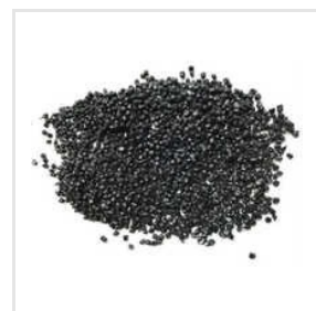
Black Nylon 6 Granules