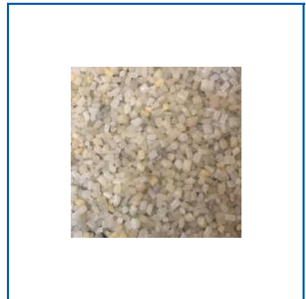
COMPOUNDING GRADE NYLON 66 NATURAL GRANULES