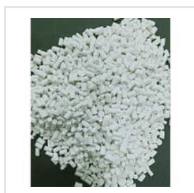
Milky Nylon Granules