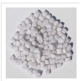
Nylon 12 Grinding Granules