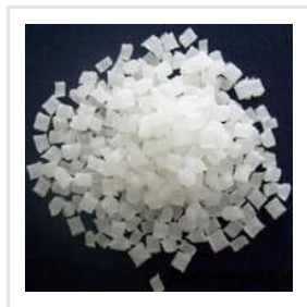
Nylon 12 Chips