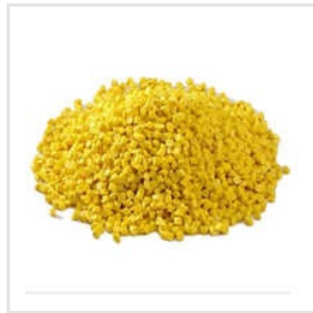
Yellow Nylon Granules