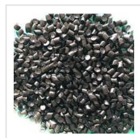
General Purpose Grade Nylon 66 Black