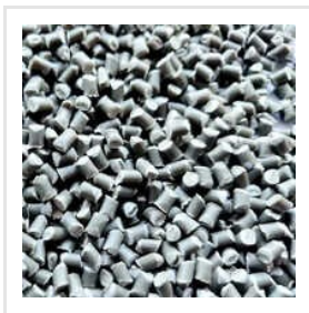
Recycled Nylon 6 Granules