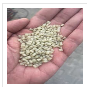
Dull Natural Nylon Granules