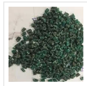
Green Nylon Granules