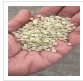
Semi Natural Nylon Granules