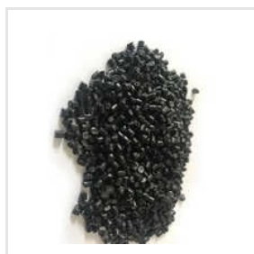
Compounding Grade Nylon 66 Black