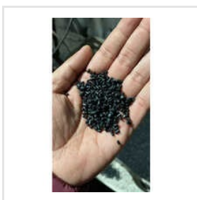
Black Nylon 6 FR Granule