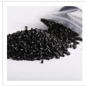
Black Nylon Granules