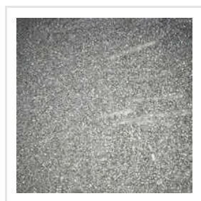
Mineral Filled Nylon 66 Granules