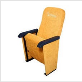
Sotase Single Seater Auditorium Chair