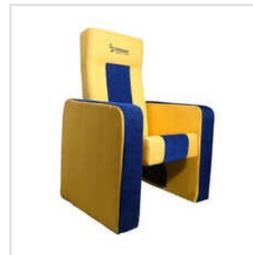
Sotase 28 Inches Push Back Theater Chair