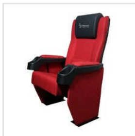
Sotase Cinema Hall Chair