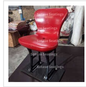
Sotase Stadium Chair