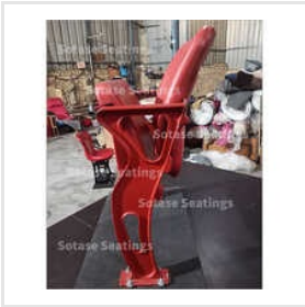
Sotase Stadium Plastic Chair