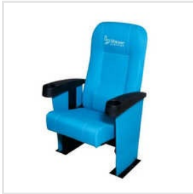
Sotase Sky Blue Auditorium Chair