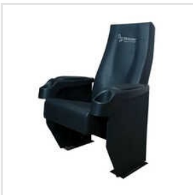
Sotase Black Cinema Chair