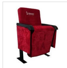
Sotase Tip Up Auditorium Chair