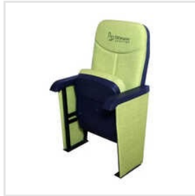
Sotase Modern Auditorium Chair