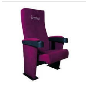
Sotase Push Back Cinema Chair