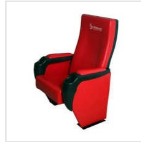
Sotase 22 Inches Multiplex Cinema