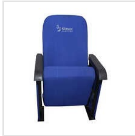
Sotase Royal Blue Auditorium Chair