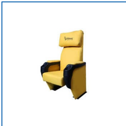
SOTASE MUSTARD YELLOW MULTIPLEX CINEMA CHAIR