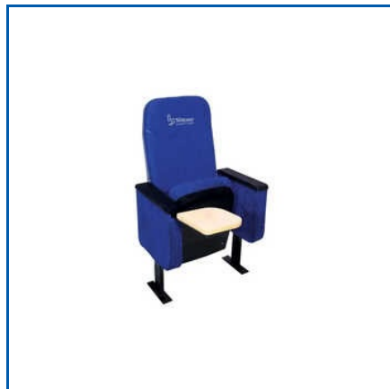
SOTASE AUDITORIUM CHAIR WITH WRITING PAD