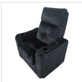
Sotase Cinema Auditorium Push Back