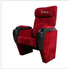
Sotase Maroon Multiplex Cinema