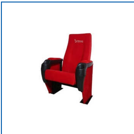
SOTASE RED MULTIPLEX CINEMA CHAIR

Sotase 22 inches Multiplex Cinema Chair, Sotase 28 inches Push Back Theater Chair, Sotase Auditorium Chair With Writing Pad, Sotase Black Cinema Chair, Sotase Cine Auditorium Chair, Sotase Cinema Auditorium Push Back Sofa Chair, Sotase Cinema Hall Chair, Sotase Maroon Multiplex Cinema Chair, Sotase Modern Auditorium Chair, Sotase Multiplex Cinema Chair, Sotase Mustard Yellow Multiplex Cinema Chair, Sotase Push Back Cinema Chair, Sotase Red Multiplex Cinema Chair, Sotase Royal Blue Auditorium Chair, Sotase Single Seater Auditorium Chair, etc.