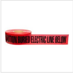
PE Warning Tapes For Safety