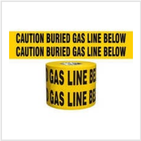
Gas Pipeline Warning Tapes