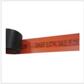
Polyethylene Adhesive Warning Board Tape