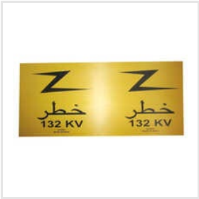
Polyethylene Electrical Cable Protection