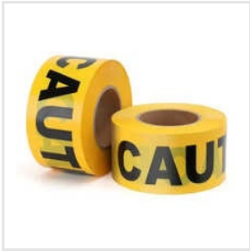
Warning Caution Barricade Tape