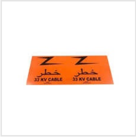
1000x244x5mm PE Cable Protection Tiles