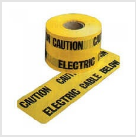
PE Colored Warning Board Tape