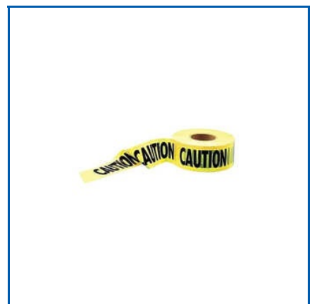
PE HAZARD WARNING TAPE