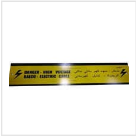
1000x150x5mm PE Cable Protection Tiles