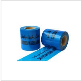
PE Water Pipeline Warning Tape