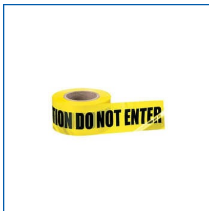
YELLOW WARNING TAPE