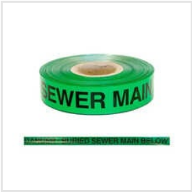
PE Sewer Line Warning Tape