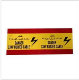
PE Cable Protection Covers