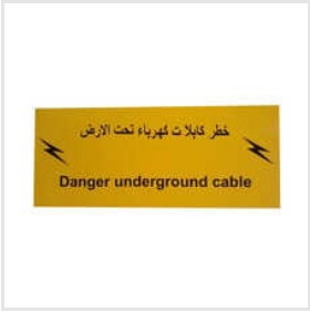
PE Electrical Cable Protect Cover