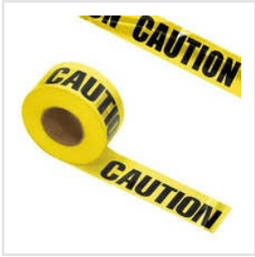
PE Barricading Warning Tape