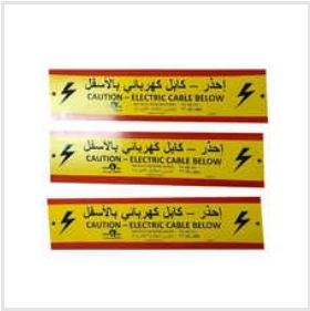
Customized PE Cable Protection Tile