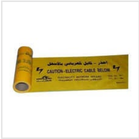
HDPE Printed Warning Board Tape