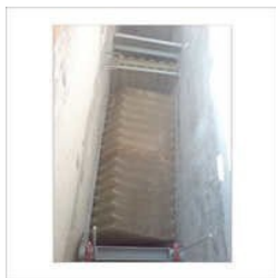
CROSS FLOW SEPARATOR

5 KLD, API 34576, API Separators, Air Saturation Vessel, Carbon Canister, Cross Flow Separator, DAF, DAF FOR BORL REFINERY, Daf Top Skimmer, Dissolved Air Flotation System, Dissolved Air Flotation, Dissolved Air Flotation Systems, Effluent Corrugated Plate Packs, Flash Mixer Agitator, Flow Distribution Baffle, etc.