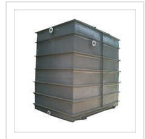
Organic Liquid Phase Separator