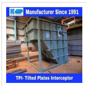
Tiled Plate Interceptor