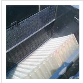
Effluent Corrugated Plate Packs