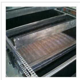
Daf Top Skimmer