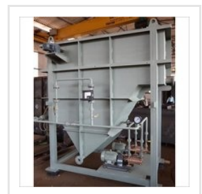
Skid Mounted Daf With Aeration Pumps