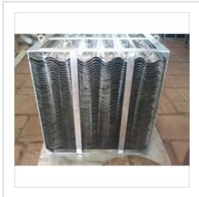
SS Plate Pack Frame