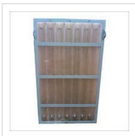
Frp Plate Pack