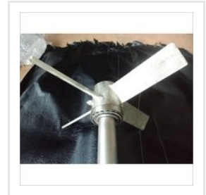
Flash Mixer Agitator