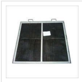
Plate Pack Coalescer