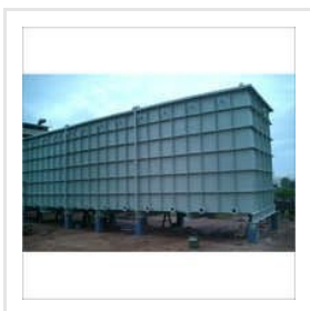
Steel TPI Separators