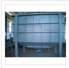
Lamella Plate Settler