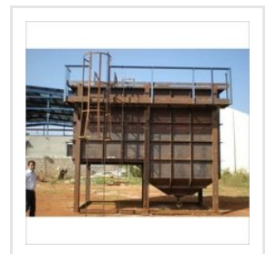
Inbuilt Flocculator With Lamella Settler