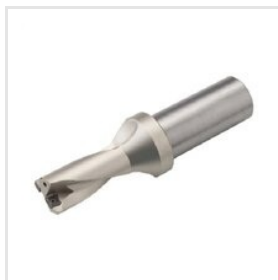
Core Drill Manufacturer