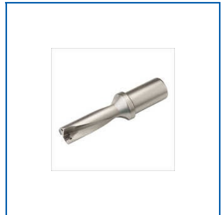
INDEXABLE U DRILL