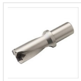
Indexable Drill Exporter