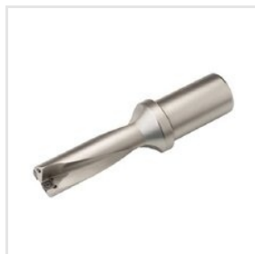
Indexable U Drill Manufacturer