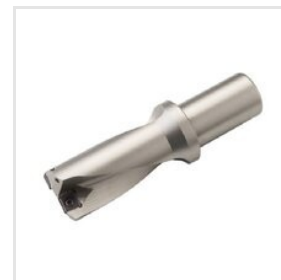
U Drill Manufacturer