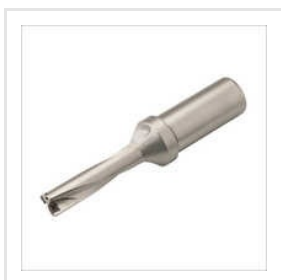
Indexable Insert Drill