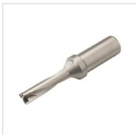
Indexable Insert Drill Manufacturer