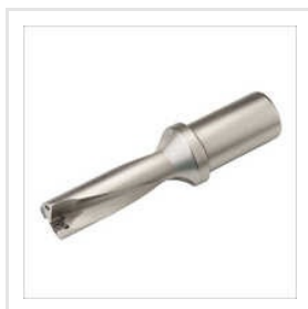
Indexable U Drill