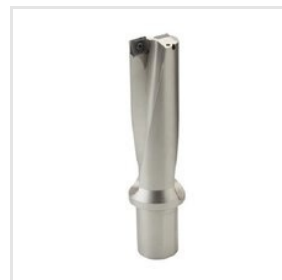
Inserted U Drill Manufacturer