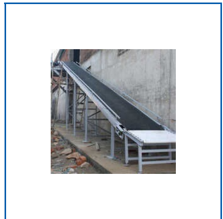
INCLINED BELT CONVEYOR