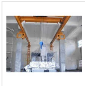
Electric EOT Crane