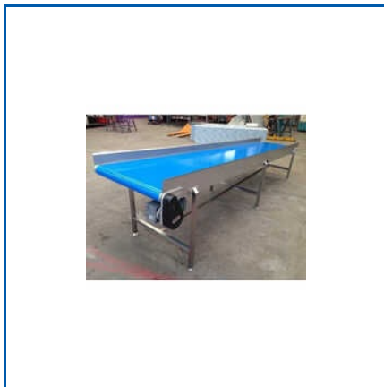
INDUSTRIAL BELT CONVEYOR

10 Ton Single Beam EOT Crane, 2 Ton Electric Lifts, 2 Ton Freight Elevator, 5 Ton Wall Mounted Jib Crane, Electric EOT Crane, Electric Wire Rope Hoist With Trolley, Electrical Scissor Lift, Hydraulic Cargo Lift, Hydraulic Double Mast Lift, Hydraulic Goods Lifts, Hydraulic Scissor Lift, Hydraulic Scissor Lift For Warehouse, Hydraulic Scissor Lift Table, Inclined Belt Conveyor, Industrial Belt Conveyor, etc.