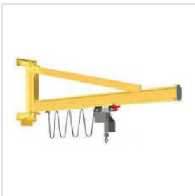
5 Ton Wall Mounted Jib Crane