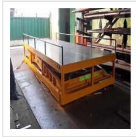
Hydraulic Scissor Lift For Warehouse