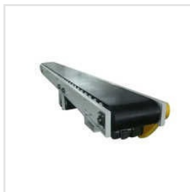
Industrial Rubber Belt Conveyor