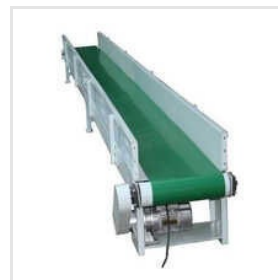
Material Handling Belt Conveyor