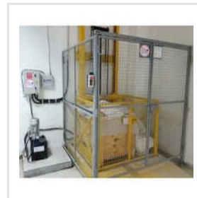
Hydraulic Cargo Lift