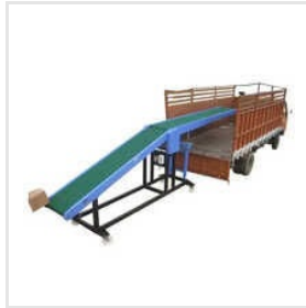
Truck Loading Conveyors