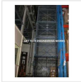
Vertical Reciprocating Lift