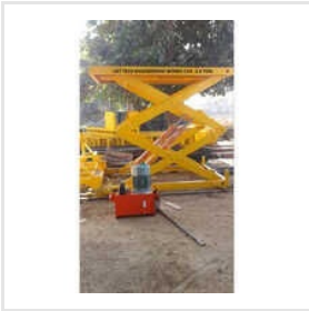
Hydraulic Scissor Lift