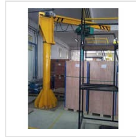
Pillar Mounted Jib Cranes