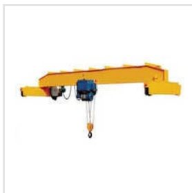
10 Ton Single Beam EOT Crane