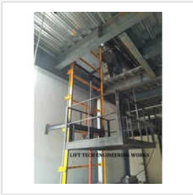
Material Handling Lift