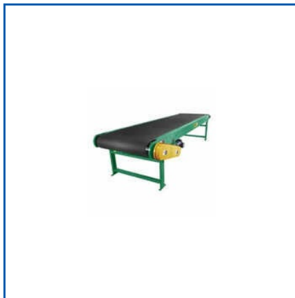
MS BELT CONVEYER