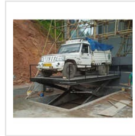
Hydraulic Scissor Lift Table