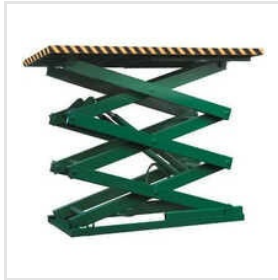
Electrical Scissor Lift