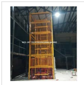
Hydraulic Goods Lifts