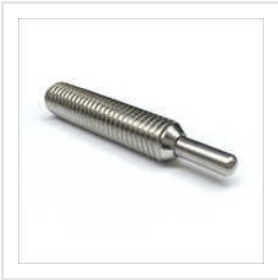
Steel Spring Plunger