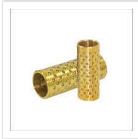
Brass Round Ball Cage