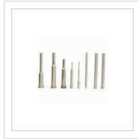
HSS Step Punch