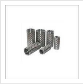
Al Round Ball Cage