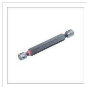
Plain Plug Gauges