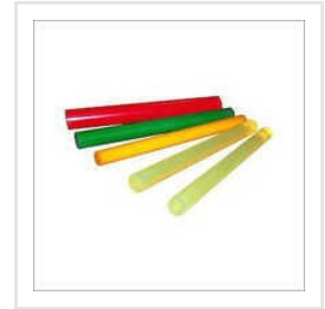
PU Round Rod