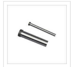
High Speed Steel Punch