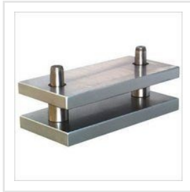
Center Pillar Die Set