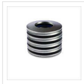
Steel Disc Springs