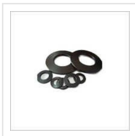
Rubber Disc Washer