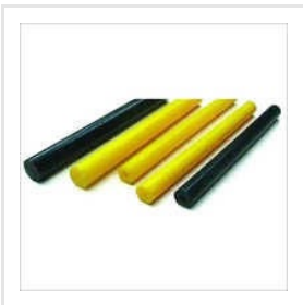
PU Colored Rod