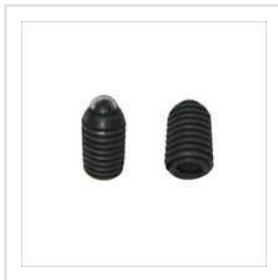
Steel Threaded Ball Plungers