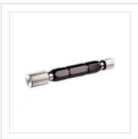
Taper Plug Gauges