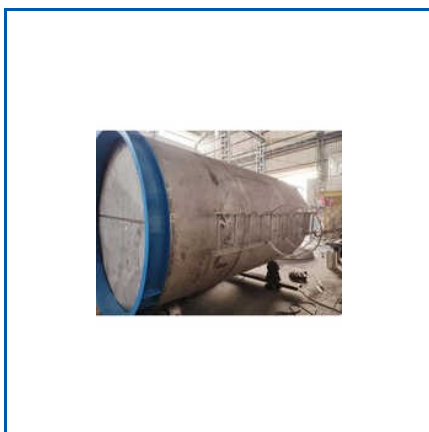
SULPHURIC ACID STORAGE TANK

1.5KL Stainless Steel Mixing Kettle, 10KL Stainless Steel Jacketed Tank, 300 mm Mild Steel Roller Conveyor, 3KL Resin Plant, 5KLSS 316 Chemical Reactor With MS Jacket, Chemical Storage Tank, Cooper Tube Bundle Heat Exchanger, Electric Heating Kettle, Furnace Oil Storage Tank, Heat Exchanger Retubing Repairing Services, Heavy Structural Fabrication Works Services, High Pressure Reactor, Industrial Heat Exchanger, Industrial Mild Steel Storage Rack, Industrial Steam Jacketed Kettle, etc.