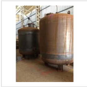
MS Pressure Sand Filter