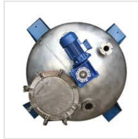
1.5KL Stainless Steel Mixing Kettle