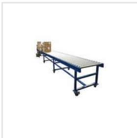
300 Mm Mild Steel Roller Conveyor