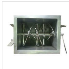
SS304 Rectangular Ribbon Blender