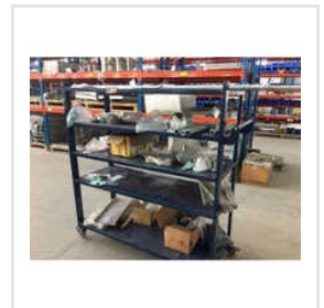
MS Material Handling Trolley