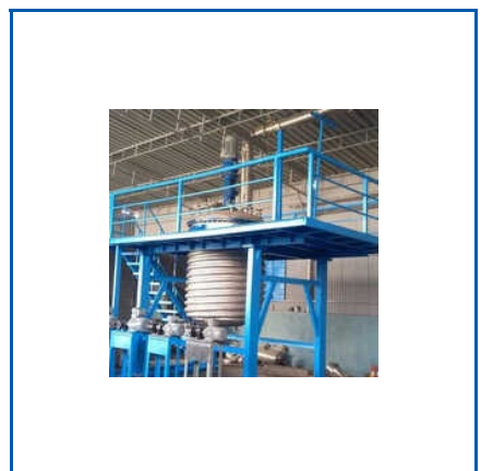
3KL RESIN PLANT