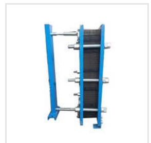
MS Plate Heat Exchanger