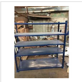
Industrial Mild Steel Storage Rack