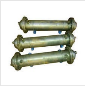
SS 316 Oil Cooler