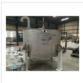
SS Condensing Storage Tank