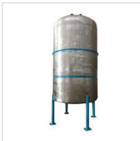
Chemical Storage Tank