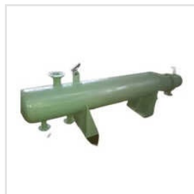
Reboiler Heat Exchanger