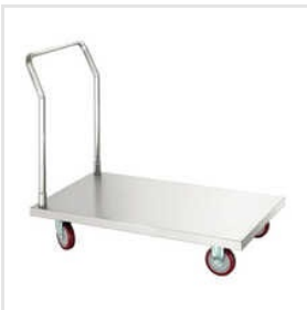
SS Platform Trolley