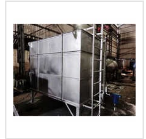
Furnace Oil Storage Tank