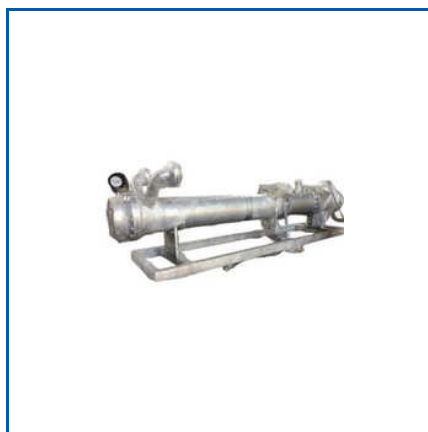
INDUSTRIAL HEAT EXCHANGER