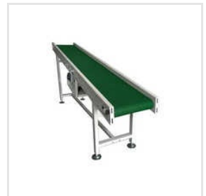
MS ACP Belt Conveyor