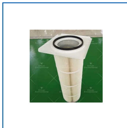
P191194 CYLINDER GAS PLEATED AIR FILTER CARTRIDGE