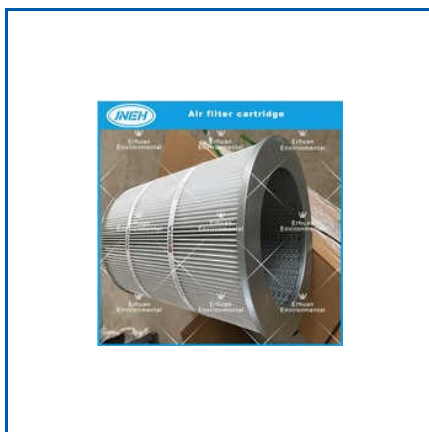
DUST COLLECTOR PLEATED POLYESTER AIR FILTER CARTRIDGE