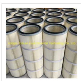
Industrial Polyester PTFE Flame Retardant