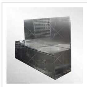
Stainless Steel Downdraft Table For