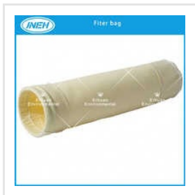
Bag Filter For Baghouse Dust Collectors