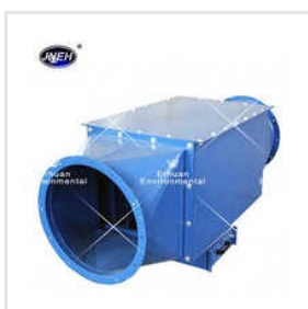
400mm Diameter Duct Spark Trap