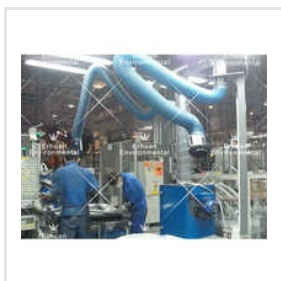
Filter Type Welding Fume Extraction Arms