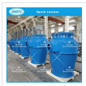
Inner Duct Spark Arrestor