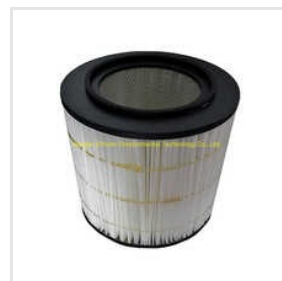
Cylindrical Pleated Dust Filter Cartridge