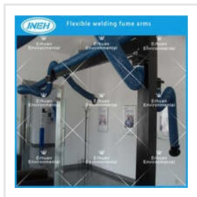
Flexible Exhaust Arm With Exhaust Hood