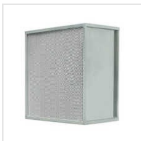
H13 Uh17 HEPA Filter For Dust Collector