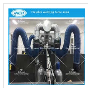
Carbon Steel Exhaust Arm With Exhaust