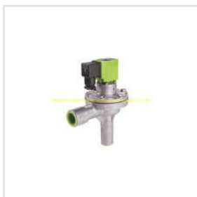
Diaphragm Structure Solenoid Valves