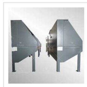
Anti-Explosion Grinding Dust