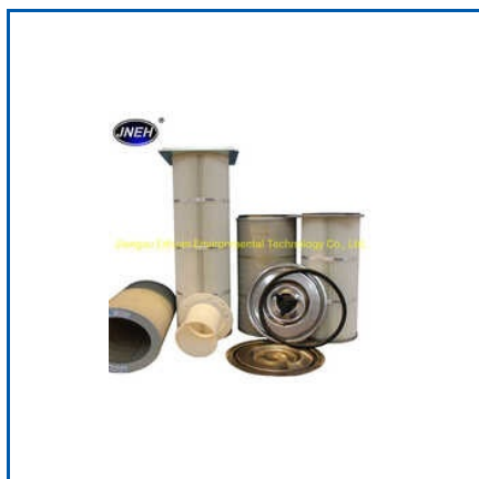
ANTISTATIC-COATING WASHABLE FILTER CARTRIDGE

400mm Diameter Duct Spark Trap, 50L 3HP Portable Vacuum Dust Collector, Air Filter Cartridge Dust Collector Cover, Anti-Explosion Grinding Dust Removal Bench With Cartridge Filter, AntiExplosion Wet Dust Collector For Aluminum Copper, Antistatic-Coating Washable Filter Cartridge, Automatic Cartridge Dust Collector, etc.