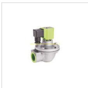
Dmfz25-Aad Diaphragm Structure