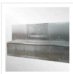
Self Cleaning Welding And Grinding