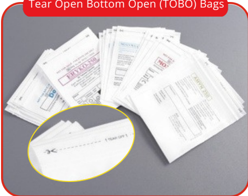
Tear Open Bottom Open (TOBO) Bags