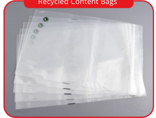
Recycled Content Bags