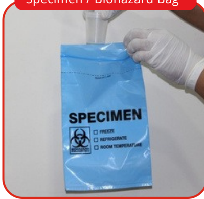
Specimen / Biohazard Bag