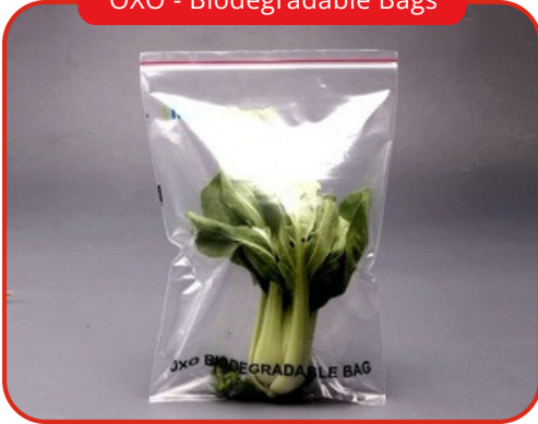
OXO - Biodegradable Bags