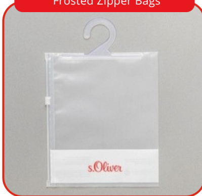
Frosted Zipper Bags