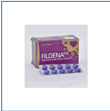
100 MG SILDENAFIL CITRATE TABLETS

0.5 MG Dutasteride Capsules IP, 0.5 MGDutasteride Tablets, 10 GM Mederma Skin Care For Scars, 10 MG Enalapril Maleate Tablets, 10 MG Methendienone Tablets, 100 MG Sildenafil Citrate Tablets, 100 MG Tapentadol Extended Release Tablets, 10etc.