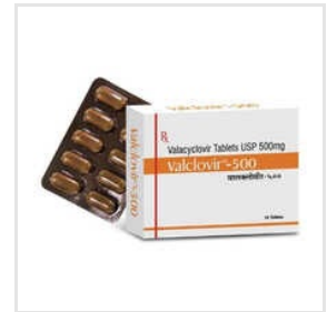
Valacyclovir 500 Mg Tablets