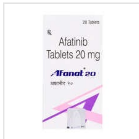
Afatinib 20 Mg Tablet