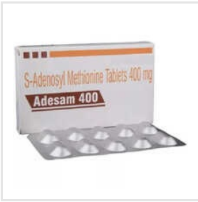
Adesam Adenosy Methionine Tablet