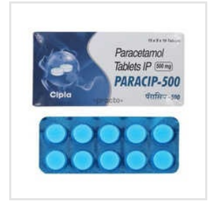
500 MG Paracetamol Tablets IP