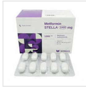
Metformin Stada 1000mg