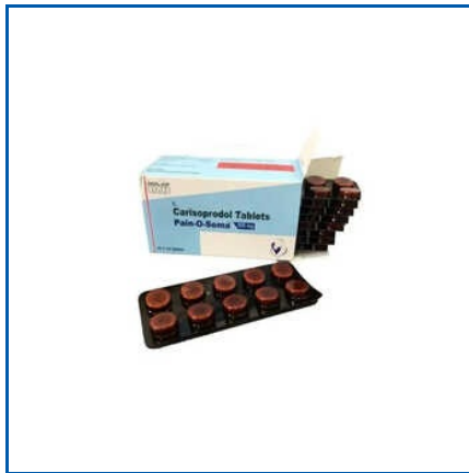
PAIN O SOME 500 MG TABLETS