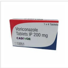
Cadivor 200mg Tablet