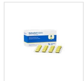
Ketostril Tablets 100