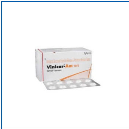
VINICOR AM 25