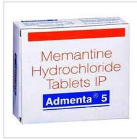
Admenta 5 Tablet