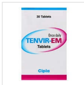
Tenvir Em Tablet