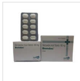
Bempedoic Acid 180mg Tablets