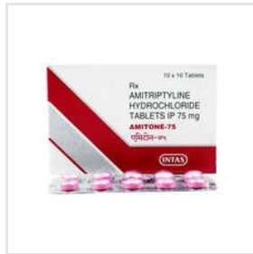
Amitone 75 Mg Tablets