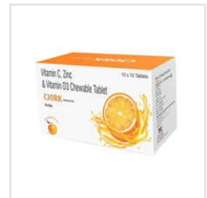
Vitamin C Vitamin D3 And Zinc Tablet