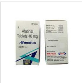
Afatinib 40 Mg Tablet