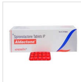
Aldactone 25 Mg Tablet