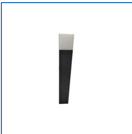
SQUARE BOLLARD LIGHT

Decorative Aluminium Decorative Lighting Poles, Decorative Antique Copper Lighting Poles, Decorative Double Arm Lighting Poles, Decorative Garden Lighting Poles, Decorative Lighting Poles, Decorative Poles, Garden Lighting Poles, Garden Post Top Lighting Poles, Laser Bollard Light, Laser Decorative Garden Bollard Light, Laser Path Way Bollard Light, Lighting Poles, Path Way Bollard Light, Post Top Bollard Light, Single Arm Decorative Lighting Poles, etc.