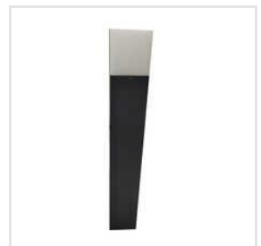
Square Bollard Light