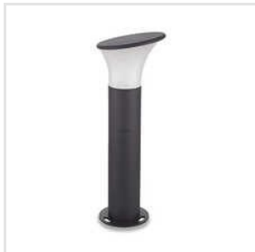
Path Way Bollard Light