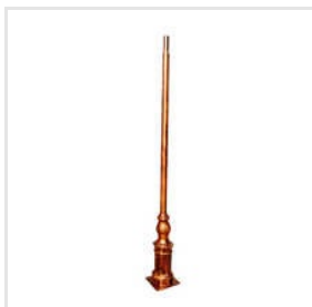
Decorative Antique Copper Lighting Poles