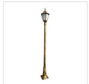
Garden Post Top Lighting Poles