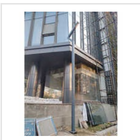
Square Lighting Poles