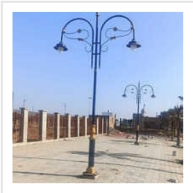
Decorative Double Arm Lighting Poles