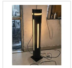
Laser Decorative Garden Bollard Light