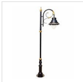
Decorative Lighting Poles