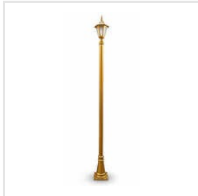
Decorative Garden Lighting Poles