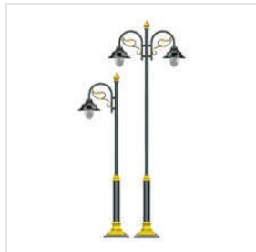
Decorative Aluminium Decorative Lighting