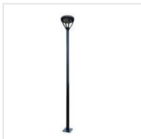
Garden Lighting Poles