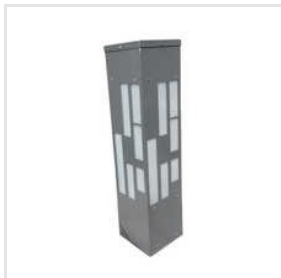
Laser Path Way Bollard Light