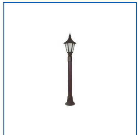
POST TOP BOLLARD LIGHT