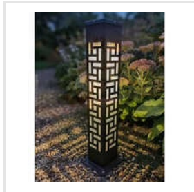
Laser Bollard Light