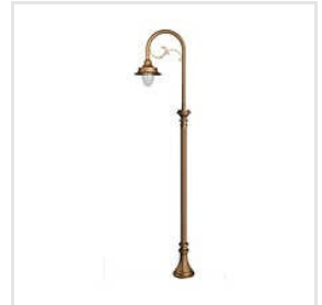
Single Arm Decorative Lighting Poles