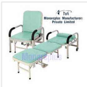
Attendant Bed Cum Chair