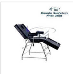
Manual Hair Transplant Chair