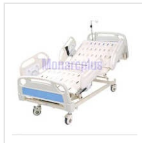
Electric Hospital Bed With 5 Functions