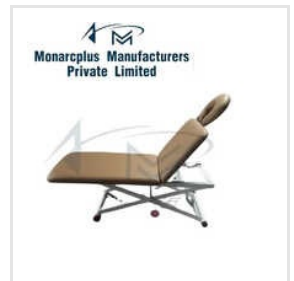
Crop Table Chair