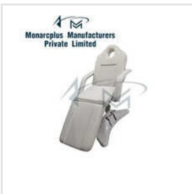
Hydraulic Chair MS Base