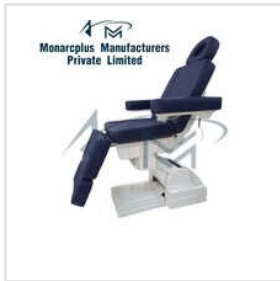
Monarcplus Dermatology Chair