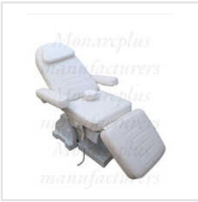
Dermatology Procedure Chair