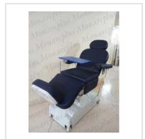
Fully Automatic Dialysis Chair