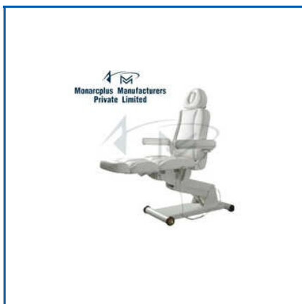
FULLY AUTOMATIC DERMATOLOGY CHAIR

110 KG Manual Dermatology Chair, Abs Bedside Locker, Apple 4 Mobile Led OT Light, Attendant Bed Cum Chair, Bar Stool Chair, Blood Collection Chair Folding Footrest, Blood Donor Chair, Blood Phlebotomy Chair, Blood Sample Collection Table, Crop Table Chair, Delivery And Labour Table, Delux Bedside Locker, Derma Chair With Detachable Pillow, Dermatology Procedure Chair, Electric Derma Bed, etc.