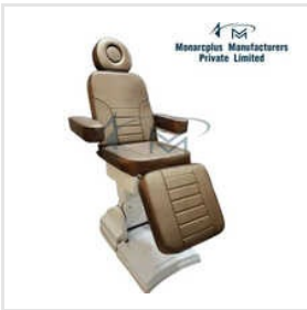
Light Brown Dermatology Chair