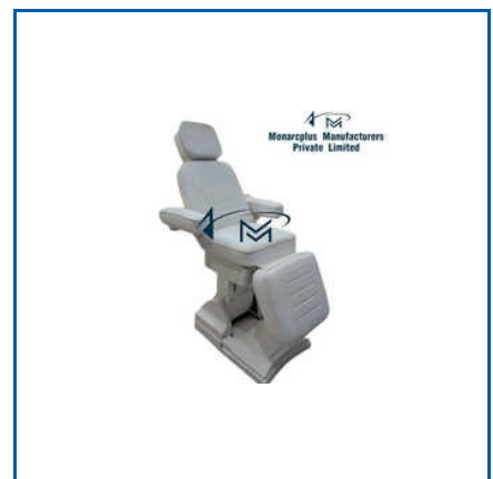
PROCEDURE DERMA CHAIR