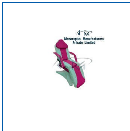
HYDRAULIC DERMA CHAIR