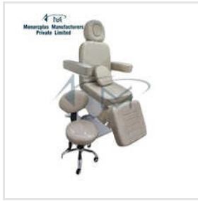
Electric Dermatology Chair