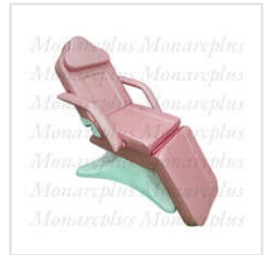
Hydraulic Derma Chair