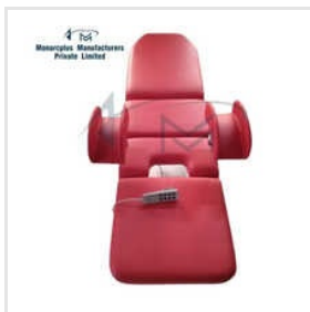
Gynae Derma Chair