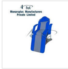
Hydraulic Dermatology Chair