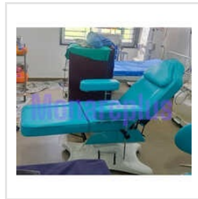
110 KG Manual Dermatology Chair