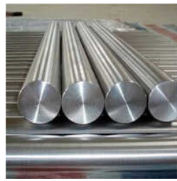
Inconel 840 Round Bar