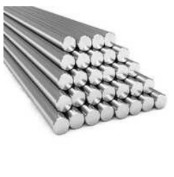
Inconel 903 Round Bar