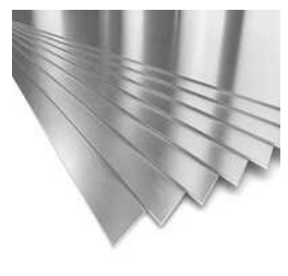
Inconel 617 Plate