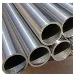
Inconel 802 Pipe