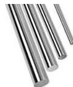
INCONEL 600 ROUND BAR