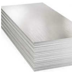
Inconel 800H Plate