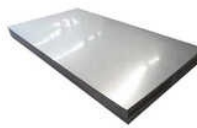
Inconel 718 Sheet