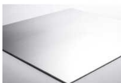
Inconel 718 Plate