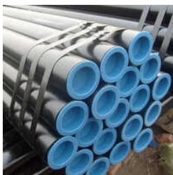
Inconel 671 Pipe