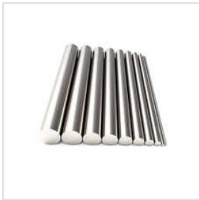
Inconel 718 Round Bar