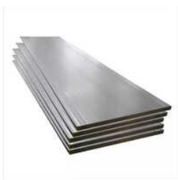
Inconel 705 Sheet