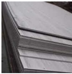
Inconel 617 Sheet