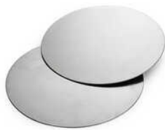
Inconel 800H Circle