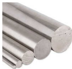
INCONEL 810 ROUND BAR