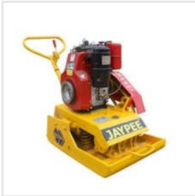
5HP Vibratory Earth Compactor