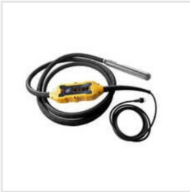
2HP Electronic Concrete Vibrator