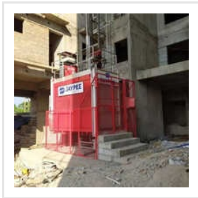
Passenger Cum Material Tower Hoist