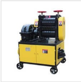
Mild Steel Scrap Bar Straightening Machine