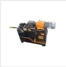
40mm Rebar Bar Threading Machine