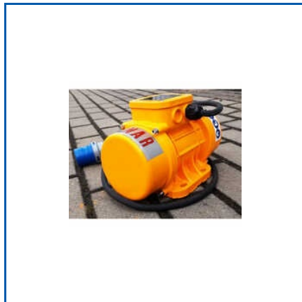
MILD STEEL SHUTTER CONCRETE VIBRATOR