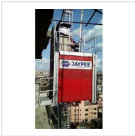
3 Ton Passenger Cum Material Tower Hoist