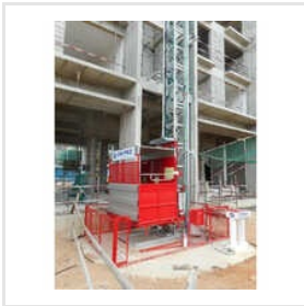
1 Ton Material Tower Hoist Machine