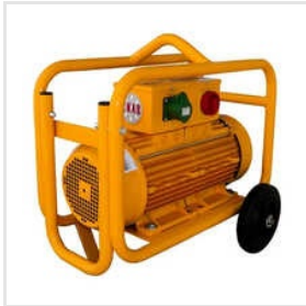
5 KVA Mechanical Frequency Converter