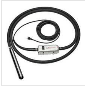
2.5HP Heavy Duty Concrete Vibrator