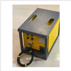
Single Phase Electric Frequency Converter