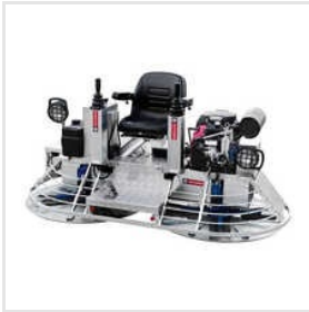
Mild Steel Ride On Trowel Machine