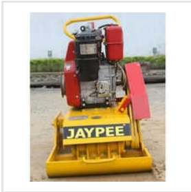
Fully Automatic Earth Compactor Machine