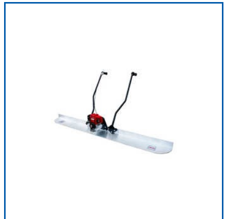
MILD STEEL CONCRETE SCREED VIBRATOR