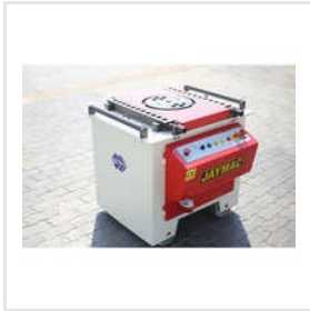
MS Bar Bending Machine