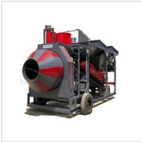
230V Reversible Drum Batch Mix Plant