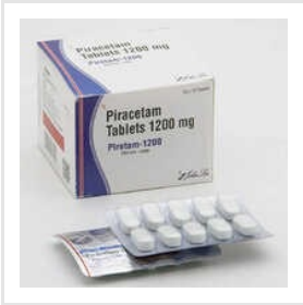
1200 MG Piracetam Tablets