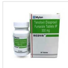
300 MG Tenofovir Disoproxil Fumarate