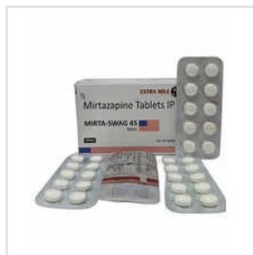
30 MG Mirtaza-Pine Tablets IP