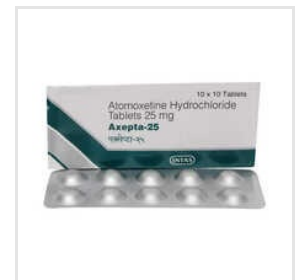
25 MG Atom-Oxetine Hydrochloride Tablets