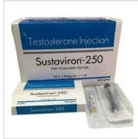
250 MG Pharma Injection