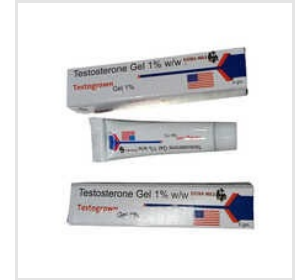
Pharma Gel 1% W-W