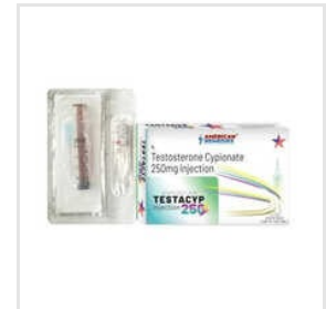
250 MG Pharma Cypionate Injection