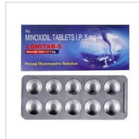
5 MG Minoxidil Tablets IP