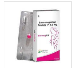
1.5 MG Levonorgestrel Tablets IP