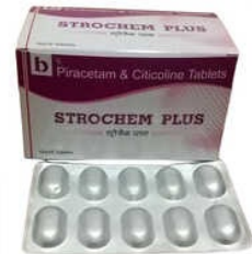
PIRACETAM AND CITICOLINE TABLETS