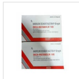
100 MG Pharma Decanoate Injection IP