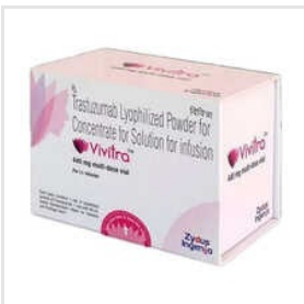
440 MG Trastuzumab Lyophilized Powder For