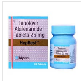
25 MG Tenofovir Alafenamide Tablets