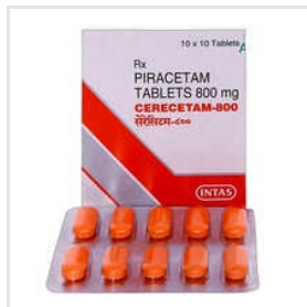
800 MG Piracetam Tablets