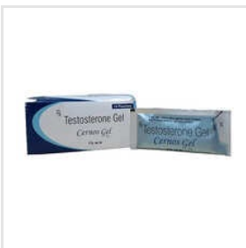
5 GM Pharma Gel