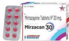
30 MG MIRTAZA-PINE TABLETS IP