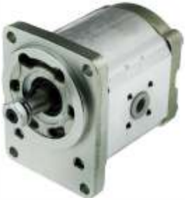
HYDRAULIC GEAR PUMP