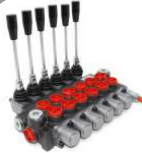
MOBILE CONTROL VALVE