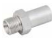
STAND PIPE ADAPTOR