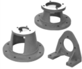
BELL HOUSING & L BRACKET