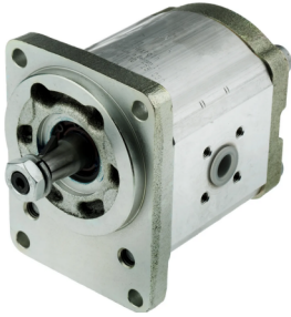
HYDRAULIC GEAR PUMP