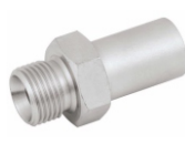
STAND PIPE ADAPTOR