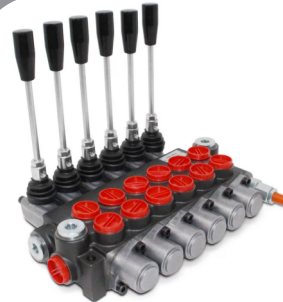
MOBILE CONTROL VALVE