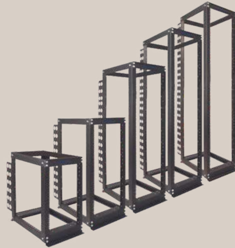
Open Frame Racks