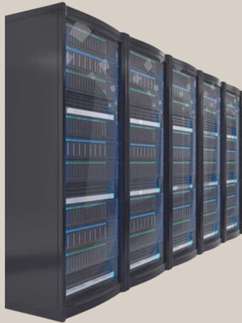
Server Rack Enclosures

A specialized network hardware case to house networking equipment that holds, stacks, organizes, secures and protects various computer network and server hardware devices.