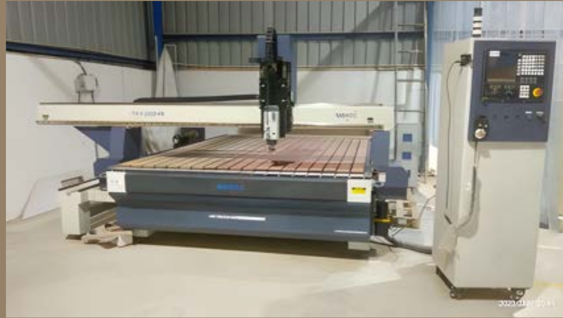
CNC ROUTER CUM ENGRAVING MACHINE WITH ROTARY ATTACHMENT