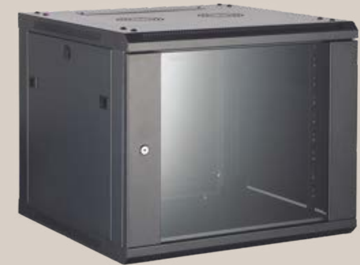
Wall Mounted Racks