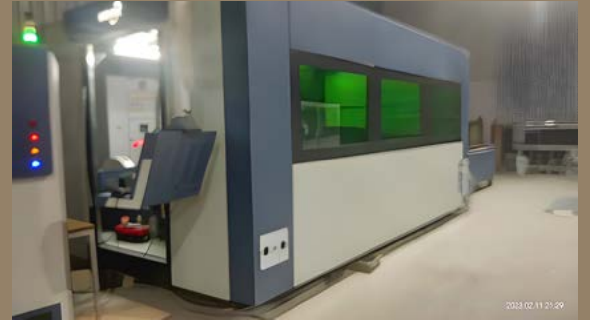
METAL UNIT MACHINES - AREA 10500 SQFT