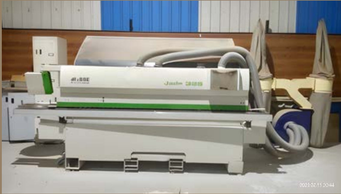
WOODEN UNIT MACHINES - AREA 6500 SQFT