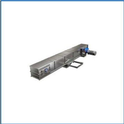
INDUSTRIAL CHAIN CONVEYOR

Industrial Air Blower, Industrial Airlock Valve, Industrial Belt Conveyor, Industrial Bucket Elevator, Industrial Chain Conveyor, Industrial Coal And Bio-Mass Handling Systems, Industrial Compartmental Bins, Industrial Grain Cleaning Plant, etc.