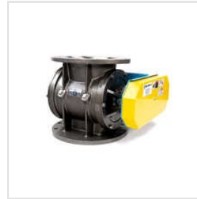
Industrial Airlock Valve