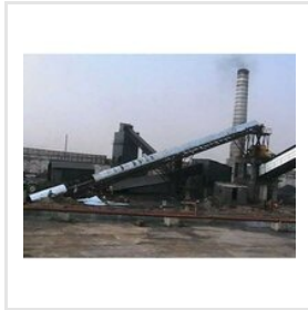
Industrial Coal And Bio-Mass Handling