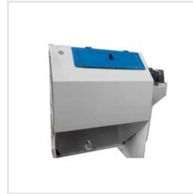
Industrial Rotary Drum Cleaner