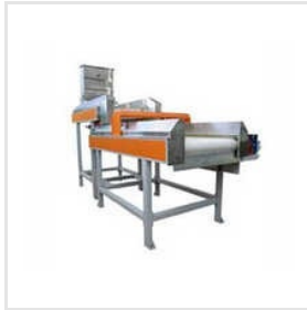
Online Flow Weigher Machine