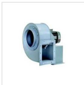
Metal Air Blower