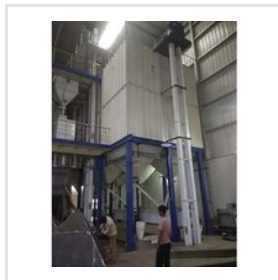
Industrial Compartmental Bins