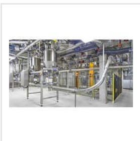
Industrial Pneumatic Conveying