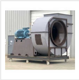
Steel Air Blower