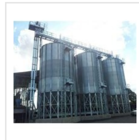
Industrial Silo Storage