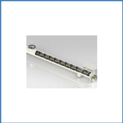
INDUSTRIAL SCREW CONVEYOR