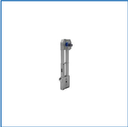
INDUSTRIAL BUCKET ELEVATOR