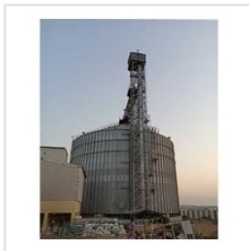
Industrial Supporting Structure Catwalk