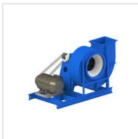
Industrial Air Blower