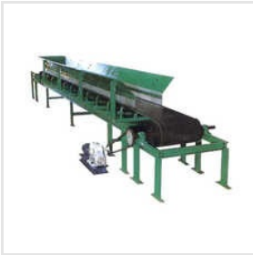
Industrial Belt Conveyor