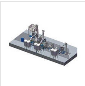
Industrial Seed Cleaning Plant