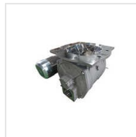
Rotary Airlock Valve