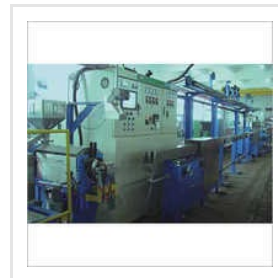
380V Extrusion Line For PTFE Cable