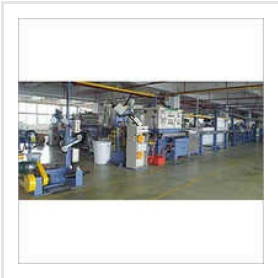
Cable Extrusion Machine For Chemical