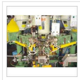
380V Extrusion Machine For Physical