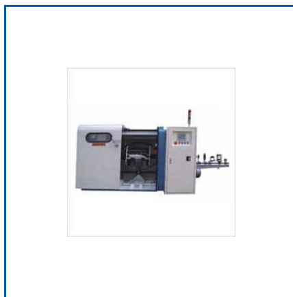
AUTO BRAKE PAIRING DOUBLE TWIST BUNCHER MACHINE