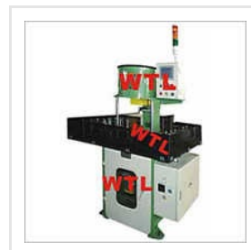
Industrial High Speed Cable Making Machine