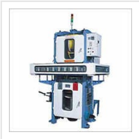
Automatic High Speed Cable Making Machine