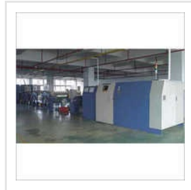
Industrial Single Twist Buncher Machine