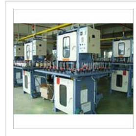
Industrial Back Twist PAF Off Machine