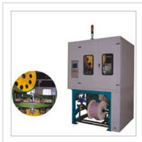
Vertical Braiding Machine