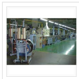
Industrial High Extrusion Line For