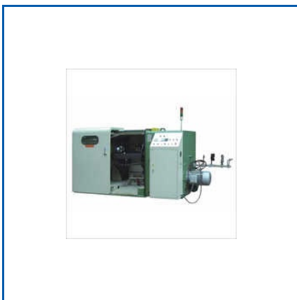
7.4HP PAIRING DOUBLE TWIST BUNCHER MACHINE

380V Extrusion Line For PTFE Cable, 380V Extrusion Line For Silicon Cable, 380V Extrusion Machine For Physical Foam Coaxial Cable, 380V High Speed Wire Cutting Machine, 45KW Flat Cable Extrusion Machine, 7.4HP Pairing Double Twist Buncher Machine, 7.5KW Tubular Strander Machine, Auto Brake Euro Type Double Twist Buncher, Auto Brake Pairing Double Twist Buncher Machine, Automatic Computer Shake Plate Machine, Automatic High Speed Cable Making Machine, Cable Extrusion Machine For Chemical Foam PE Cable, Double Column Feeder Machine, Double Head Parallel Power Line Machine, Ground Line Extrusion Machine, etc.