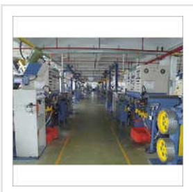
Halogen Free Cable Extrusion Machine