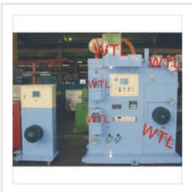
High Tech Dual Reel Tapping Machine For