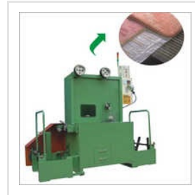
High Shielding Machine For Heating