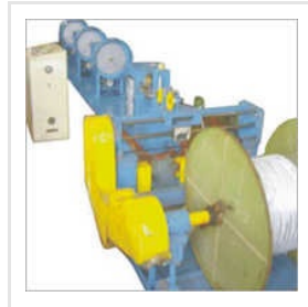
Three Layer Wrapping Machine