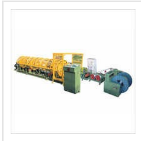
7.5KW Tubular Strander Machine