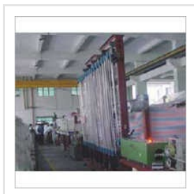
45KW Flat Cable Extrusion Machine