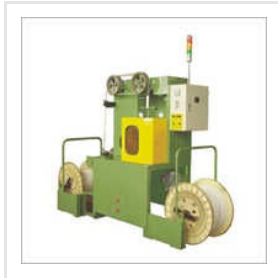
Industrial High Speed Taping Machine