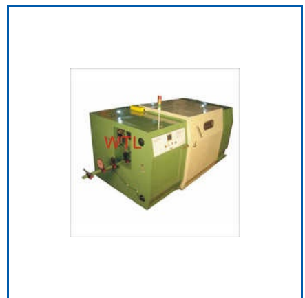
AUTO BRAKE EURO TYPE DOUBLE TWIST BUNCHER