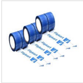
Packaging Bopp Tapes