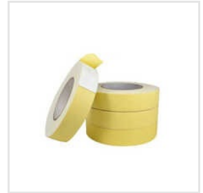
Double Sided Tapes