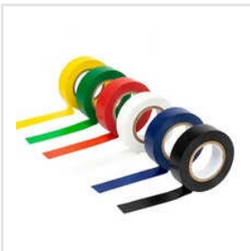
Multi Color Tape