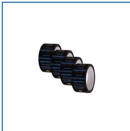
PRINTED PRIME TAPE