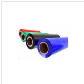
Coloured Stretch Film