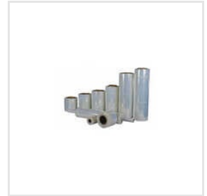
51 Microns Stretch Film