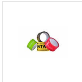
18mm Printed Tapes