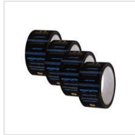
Printed Prime Tape