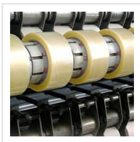
BOPP Printed Prime Tape