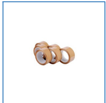
BROWN BOPP TAPES