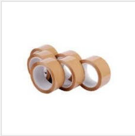
Brown BOPP Tapes