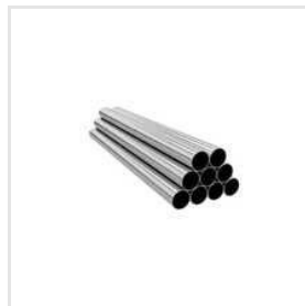
317 Stainless Steel Seamless Tube