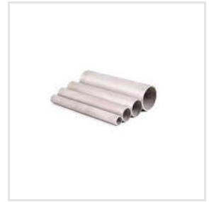
310 Stainless Steel Seamless Pipe