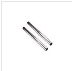
316 Stainless Steel Welded Tube