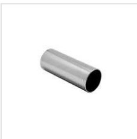
304 Stainless Steel ERW Pipe