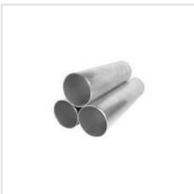
316 Stainless Steel Welded Pipe