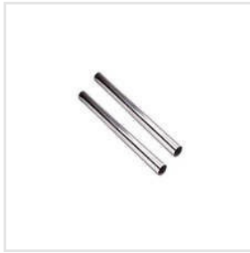
310 Stainless Steel Welded Tube