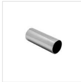
310 Stainless Steel ERW Pipe