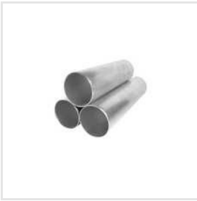
310 Stainless Steel Welded Pipe