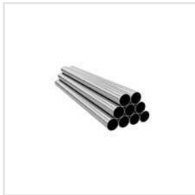
316 Stainless Steel Seamless Tube