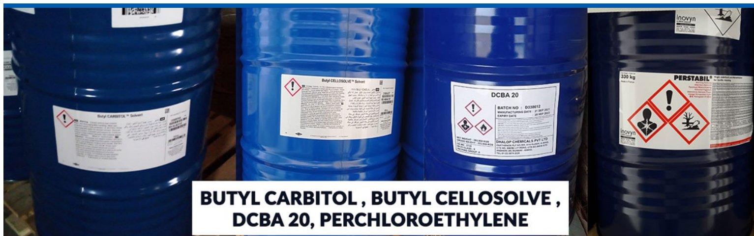
BUTYL CARBITOL , BUTYL CELLOSOLVE , DCBA 20, PERCHLOROETHYLENE

2 ETHYLHEXYL ACRYLATE, 2 HYDROXY ETHYL ACRYLATE, 2 HYDROXY ETHYL METHACRYLATE, ACRYLIC ACID, AMINO ETHYL PIPERAZINE (AEP), AMINOETHYL ETHANOL AMINE (AEEA), BISPHENOL A, BUTYL ACRYLATE (BAM), BUTYL CARBITOL, BUTYL GLYCOL, CHCl 3 Chloroform, DCBA 20, DIACETON ALCOHOL, DIETHANOLAMINE (DEA), DIETHYLENETRIAMINE (DETA), etc.