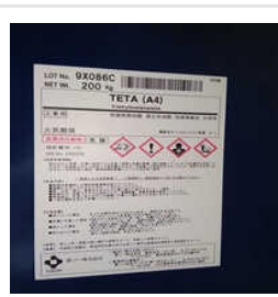
TRIETHYLENE TETRAMINE TETA