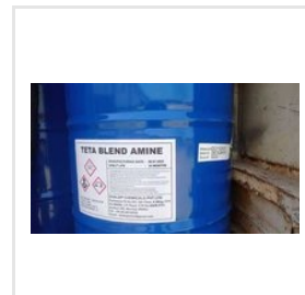
TETA BLEND AMINE