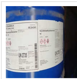
AMINOETHYL ETHANOL AMINE (AEEA)