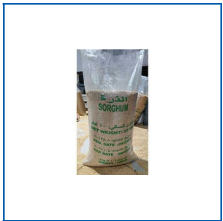
50KG SORGHUM JAWAR