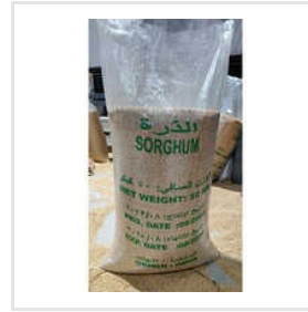
50kg Sorghum Jawar