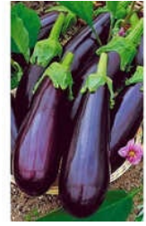
Fresh Purple Long Brinjal