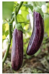
Organic Purple Long Brinjal