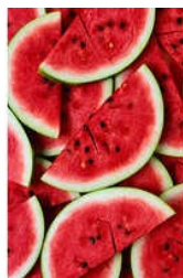
Fresh Red Watermelon