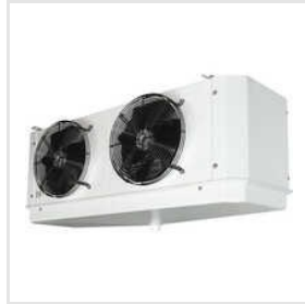
02_Cold Storage Chillers