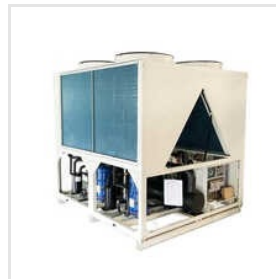
Air Cooled Modular Chiller