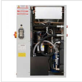
Electrical Hydraulic Oil Chillers