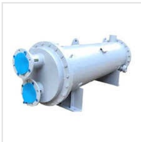
Shell And Tube Condenser