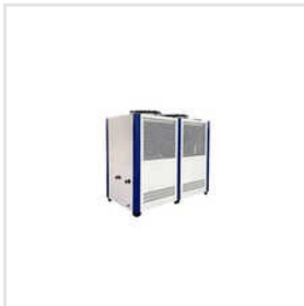
Electric Glycol Chiller