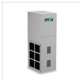
Panel Air Conditioner