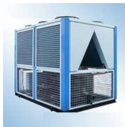
SINGLE COMPRESSOR MODULE