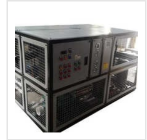
RO Water Chiller