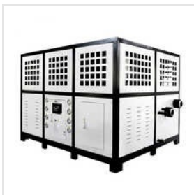
Water Cooled Packaged Chillers