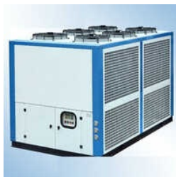
AIR COOLED PACKAGED CHILLER

01_Cold Storage Chillers, 02_Cold Storage Chillers, Air Cooled Modular Chiller, Air Cooled Packaged Chiller, Brazer Plate Heat Exchanger, Charged Air Cooled Heat Exchangers, Chilled Water Cooling Coil, Condenser Coil, DX Cooling Coil, Dry Cooling Tower, Electric Glycol Chiller, Electric Soda Chiller, Electrical Hydraulic Oil Chillers, Fan Coil Unit For Cold Rooms, Fin Tube Condenser Coil, etc.