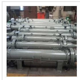
Shell And Tube Heat Exchanger