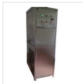
Electric Soda Chiller