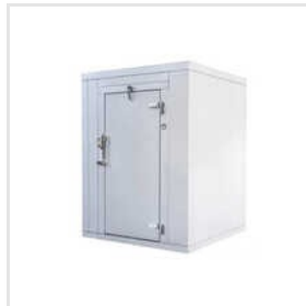
01_Cold Storage Chillers