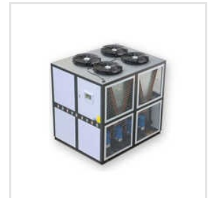
Industrial Freon Chillers