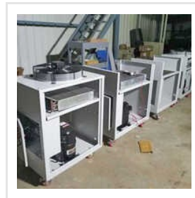
Industrial Online Chillers