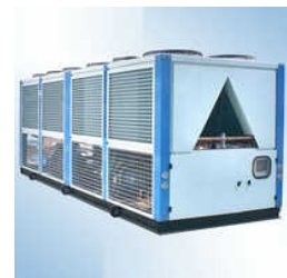
MULTI COMPRESSOR MODULE