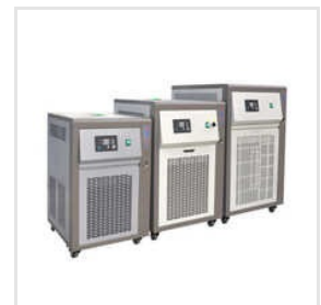
Industrial Lab Chiller