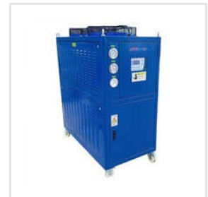
Water Cooled Modular Chiller