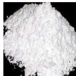
Precipitated Silica Powder