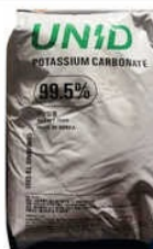
Potassium Carbonate Granular