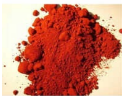
Red Lead Powder