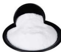
Refined Iodised Salt