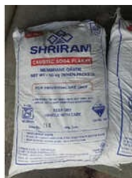
DCM SHIRAM CAUSTIC SODA FLAKES