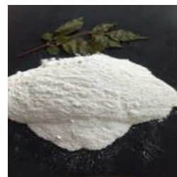
Food Grade Sodakarb