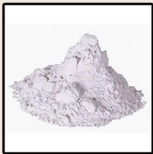
STABLE BLEACHING POWDER