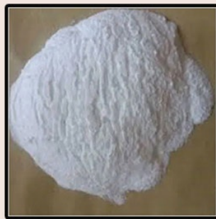
REFINED SODIUM BICARBONATE