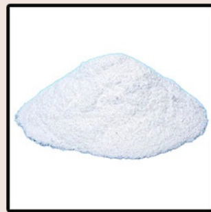
SODA ASH LIGHT

Alum Powder, Ammonia Alum Crystals, Ammonia Alum Lumps And Powder, Ammonium Alum Powder, Bleaching Powder, Borax Decahydrate, Boric Acid Powder, Caustic Potash, Caustic Soda, Caustic Soda Flakes, Citric Acid Anhydrous, Citric Acid Monohydrate, DCM SHRIRAM CAUSTIC SODA FLAKES, Dense Soda Ash, Food Grade Phosphoric Acid, etc.