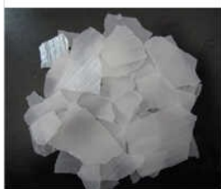
Caustic Soda Flakes