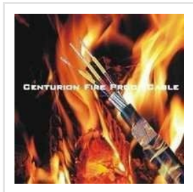
Fire Survival Cables