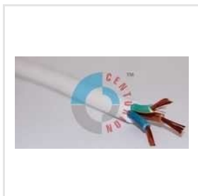
Flexible Multicore Cable