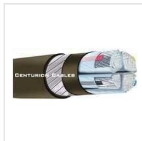
LT Xlpe Cable