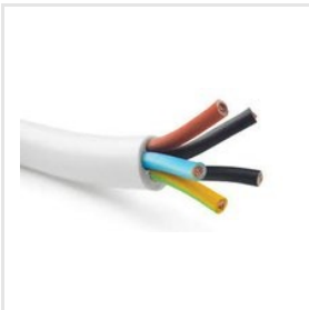
PVC Insulated Cable