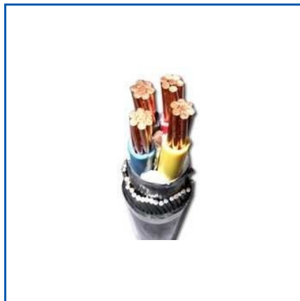
PVC ARMoured CABLE