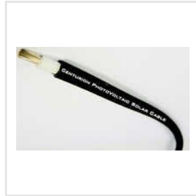
P V Solar Cable