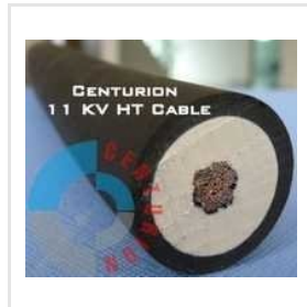
LT Elastomeric Cable