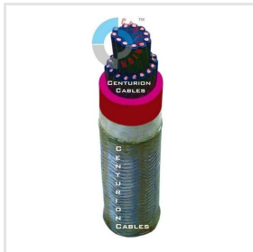
EPR Control Cable