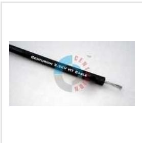
HT Elastomeric Cable