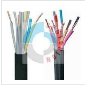
FRLS Multicore Cables