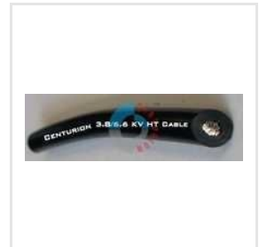
Multicore Rubber Cables