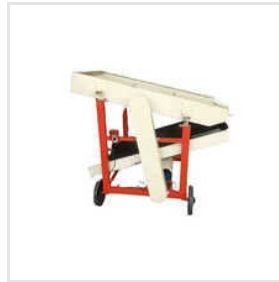
Vibratory Sand Screening Machine