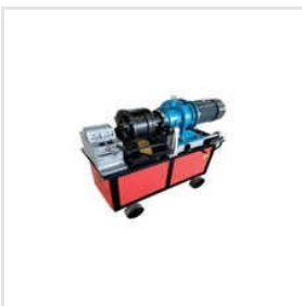
Bar Threading Machine