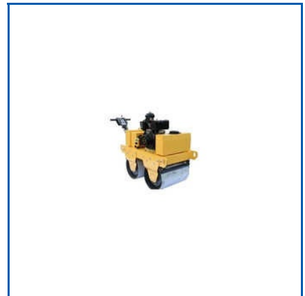
WALK BEHIND VIBRATORY ROLLER