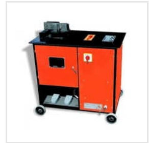
Bar Ring Making Machine