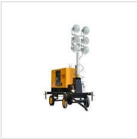
Mobile Lighting Tower