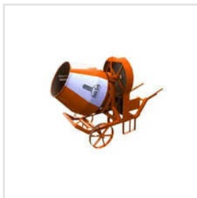
Half Bag Concrete Mixer