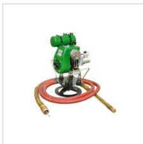
Petrol And Kerosine Needle Vibrator