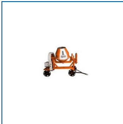
TILTING TYPE MINI MIXER