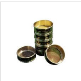
Sand Sieves Set