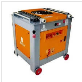
Bar Bending Machine