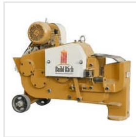
Bar Cutting Machine