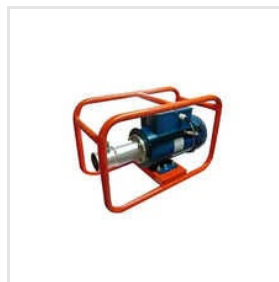
Electric Needle Vibrator