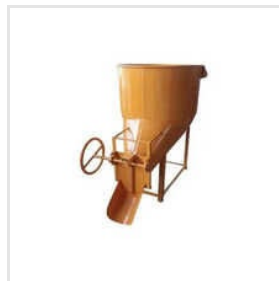
Tower Crane Concrete Bucket