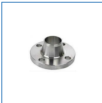
STAINLESS STEEL WELD NECK FLANGES