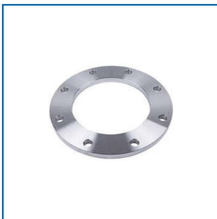
STAINLESS STEEL SLIP ON FLANGE

2 inch Mild Steel Tee, 410 Stainless Steel Round Bar, 904l Stainless Steel Round Bars, ANSI Flanges, Duplex Stainless Steel Plate, En 8 Steel Bar, Inconel 600 Elbow, Inconel 600 Flanges, Inconel 600 Nut, Inconel 600 Reducer, Inconel 600 Sheet, Inconel 601 Circle, Inconel 601 Nut, Inconel 601 Sheet, Inconel 625 Elbow, etc.