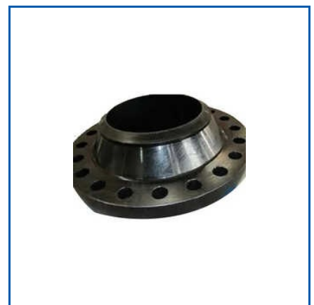
MILD STEEL WELDING NECK FLANGE