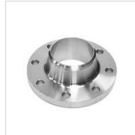
Mild Steel Weld Neck Flanges