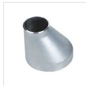
Inconel 600 Reducer