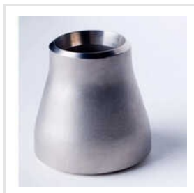
Inconel 625 Reducer