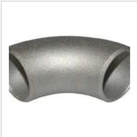
Inconel 625 Elbow