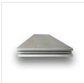
Duplex Stainless Steel Plate