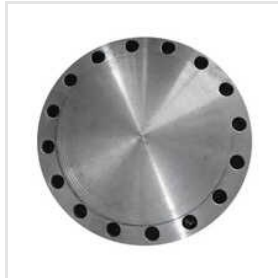
Mild Steel Blind Flange