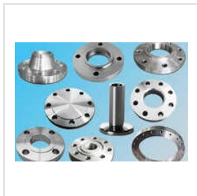
Inconel 625 Flanges