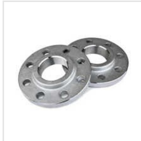
Mild Steel Slip On Flange