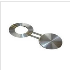
Mild Steel Spectacle Blind Flange