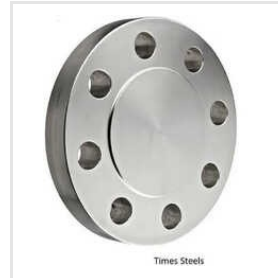
Stainless Steel Blind Flange