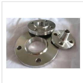
Inconel 600 Flanges