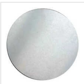
Inconel 601 Circle