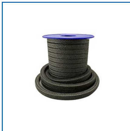
PTFE GRAPHITE PACKING