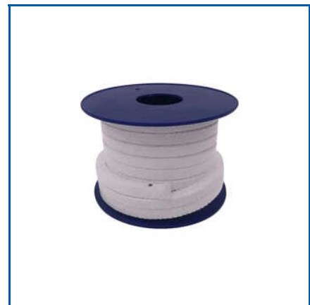
PTFE WHITE PURE PACKING