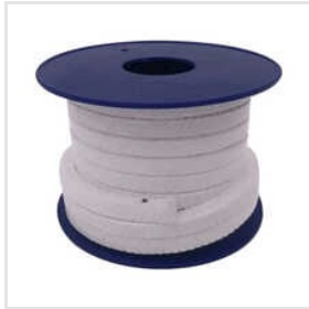
PTFE White Pure Packing