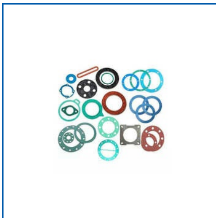
NON ASBESTOS CUT GASKET

Expanded PTFE Tape, Non Asbestos Cut Gasket, PTFE Graphite Packing, PTFE White & Aramid Combination Packing, PTFE White Pure Packing, Pure Expanded Flexible Graphite Packing, etc.