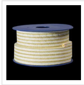
PTFE White & Aramid Combination Packing