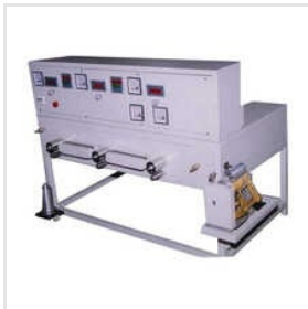
Two Stage Filament Drawing Machine