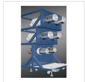
Fiber Draw Frame Unit