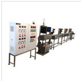
Wet Spinning Machine