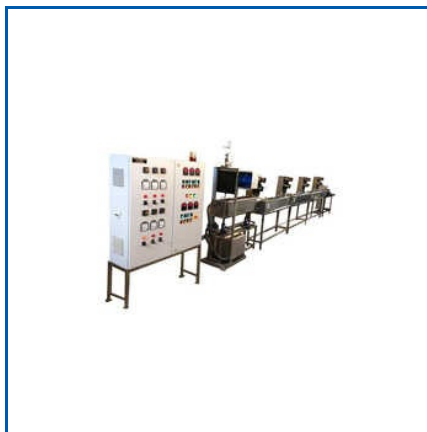
WET SPINNING MACHINE