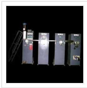
Melt Spinning Machine