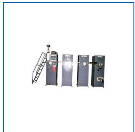
PILOT MELT SPINNING MACHINE