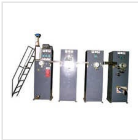
Pilot Melt Spinning Machine