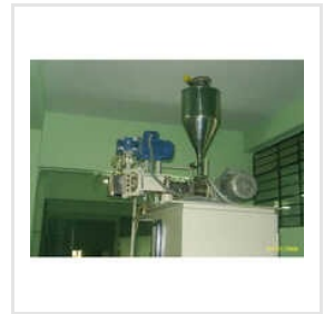
Pilot Melt Spinning