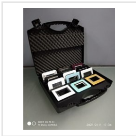
Modular Switch Plastic Display Cases