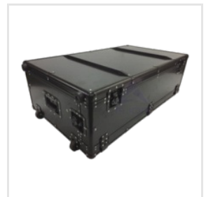
Road Flight Case