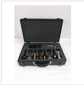
Aluminium Flight Case For Furniture Fittings