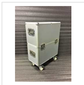
Custom Flight Case