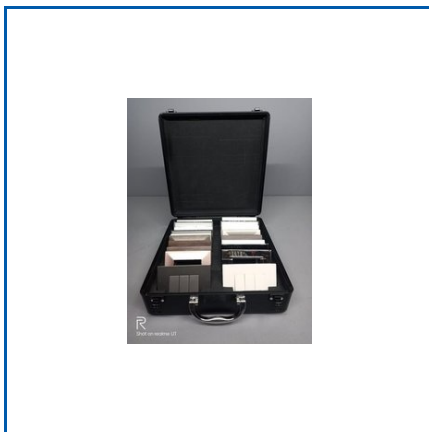
MODULAR SWITCH FLIGHT CASES

Durabox Mover, Expanded Polystyrene Foam, Insulation & Sound Proof Thermacol Packing , PP Fruit Box, Packaging Material, Plastic Bubbleguard Box, Plastic Corrugated Box, Plastic Divider Box, Polyethylene Foam (EPE), Polyurethane Foam (Pu), Polyurethane Foam Box, Returnable Box, etc.