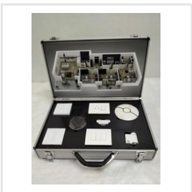
Automation Flight Case