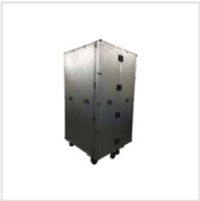
Safety Lockers Flight Case