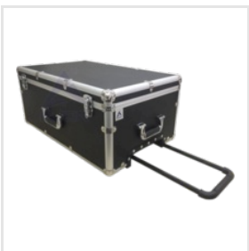
Trolley Flight Cases