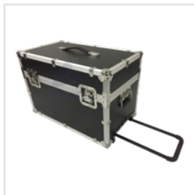
Protective Transport Case