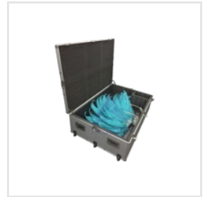
Exhibition Display Case