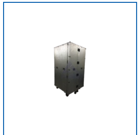
DRAWER FLIGHT CASE