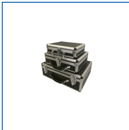
CUSTOMIZED ALUMINIUM FLIGHT CASE