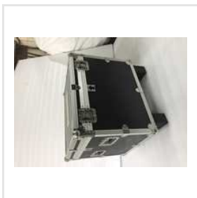
Road Flight Case