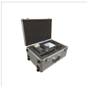
Aluminum Universal Case