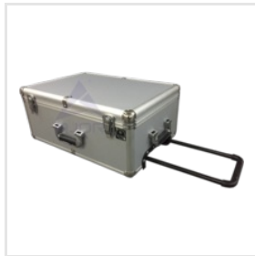
Engineering Carry Case