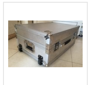
Custom ATA Flight Case