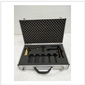
Aluminium Flight Case For Bath Fittings