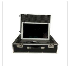
LCD Monitor Flight Case