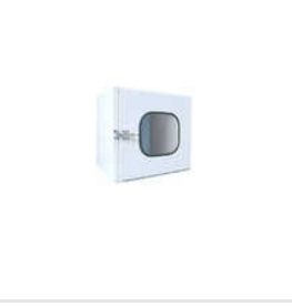
Standard Pass Box