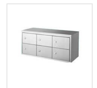
Stainless Steel Shoe Rack