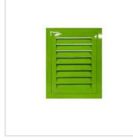
Louvered Air Vents