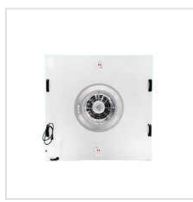
Fan HEPA Filter Units