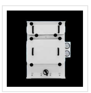
Bag In Or Bag Out