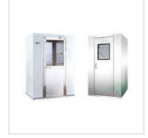
Person Air Shower