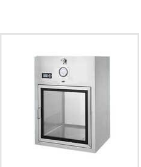
Lab Pass Box