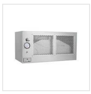
Laminar Airflow System