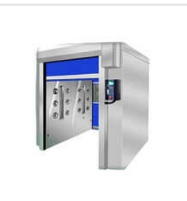
Fast Speed Automatic Rapid