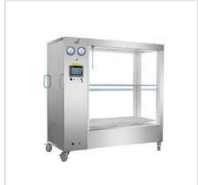
Laminar Airflow Trolley