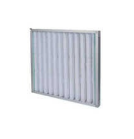
Panel Air Filter