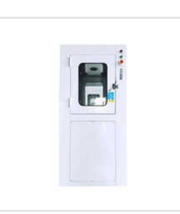
Statics And Dynamic Pass Box