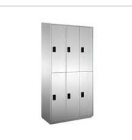
Clean Room Wardrobe