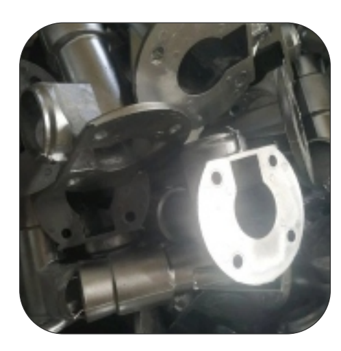
Pressure Aluminium Die Casting