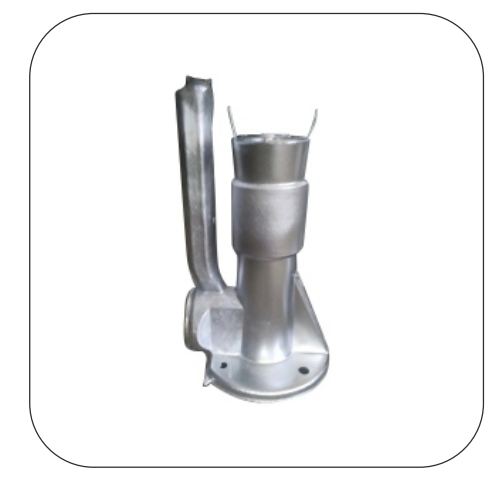
Industrial Aluminium Die Casting