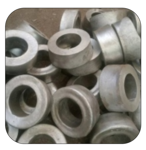
Round Aluminum Die Casting