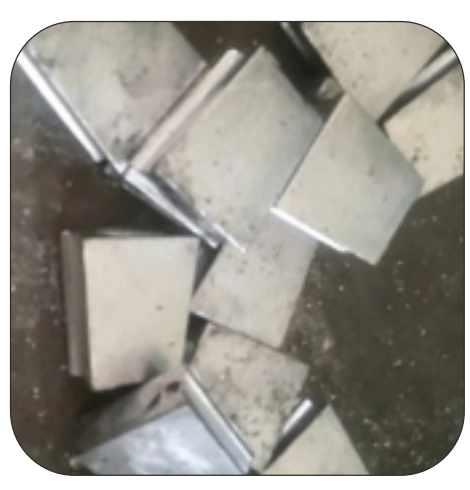
Machine Part Aluminium Die Casting