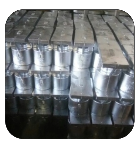
Top Cover Aluminium Die Casting