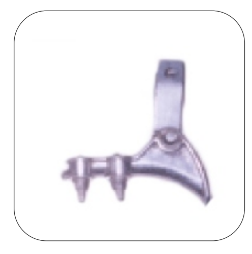
Power Transmission Line Hardware