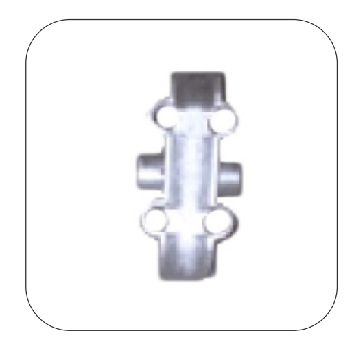
Electrical Transmission Line Hardware