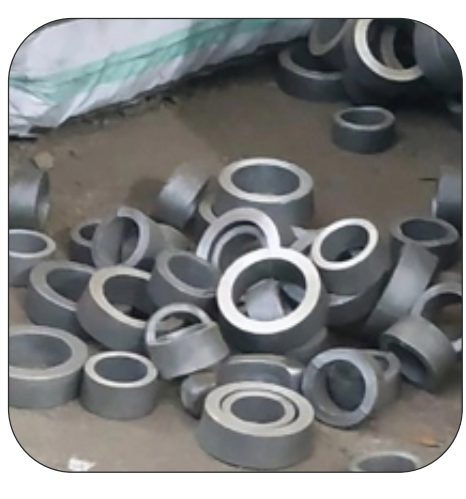
Bushing Aluminium Die Casting