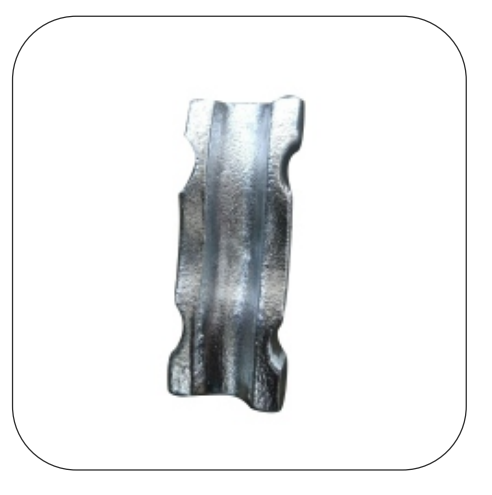
Aluminium Custoized Die Casting