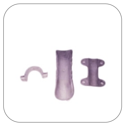
Single Tension Hardware Fittings