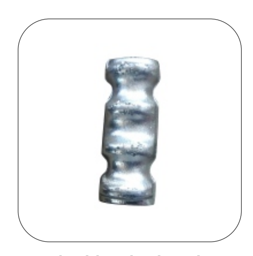
Industrial Gravity Die Casting