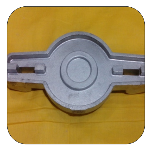
Die Casting Job Work