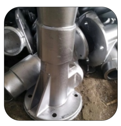
Sand Aluminium Die Casting