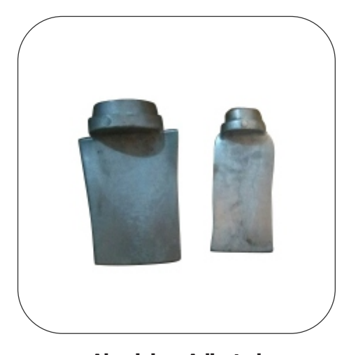
Aluminium Adjusted Die Casting