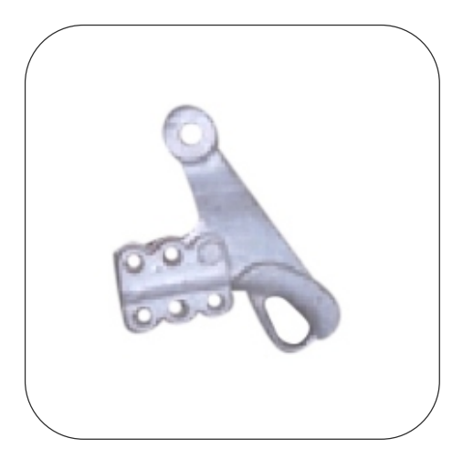
Transmission Line Hardware