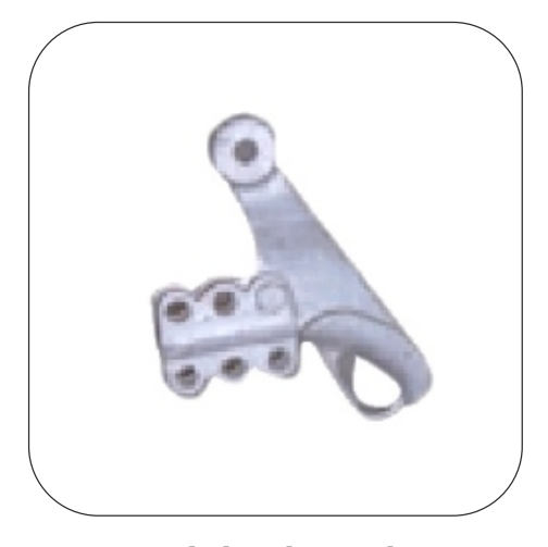
Transmission Line Hardware Fittings