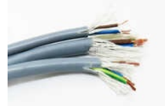
PVC Thermocouple Compensating Cable