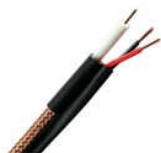
PTFE Thermocouple Copper Wires