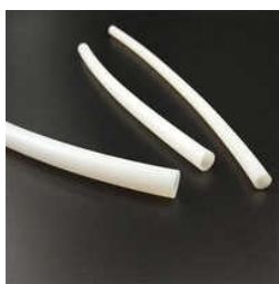
PTFE Round Hollow Sleeves Tubes