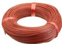
Industrial Heat Resistant Wire