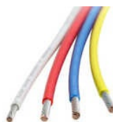
PTFE Industrial Cables