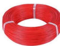
PTFE Red Insulated Wire