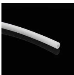
PTFE Sleeves Tubes