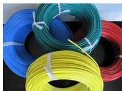
PTFE FLOOR HEATING CABLES

Color PTFE Insulated Cables, High Voltage Corona Resistant Wires, Kapton Insulated Wires, Multicore Cables, PTFE Electrical Sleeves, PTFE Floor Heating Cables, PTFE High Temperature Multicore Cables, PTFE Hook Up Wires, PTFE Hook-up Striped Wires, PTFE Insulated Multicore Cables, PTFE Insulated Sleeves, PTFE Insulated Wires, PTFE Multicore Cables, PTFE Multicore Insulated Wires, PTFE RF Coaxial Cables, etc.