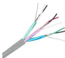
Shielded Cable Wires