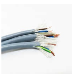
PTFE Double Shielded Cables