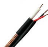
PTFE MULTICORE CABLES