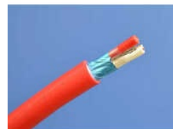
PTFE Flame Retardant Wire