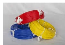
PTFE Insulated Cables