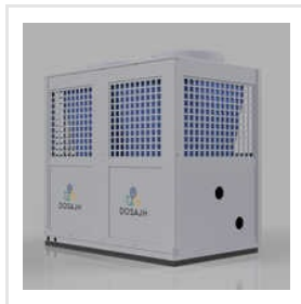
Mild Steel Industrial Swimming Pool Heat