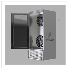
Industrial Blast Freezer