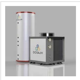
Residential Swimming Pool Heat Pump