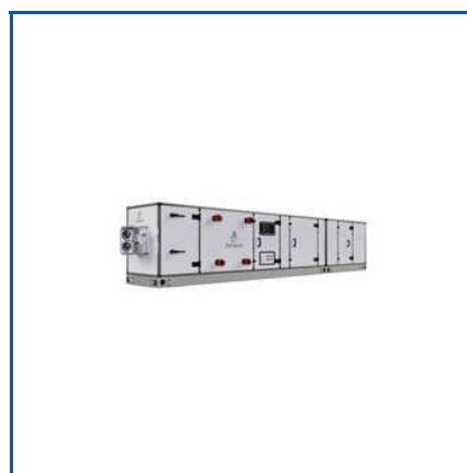
DOUBLE SKIN AIR HANDLING UNIT