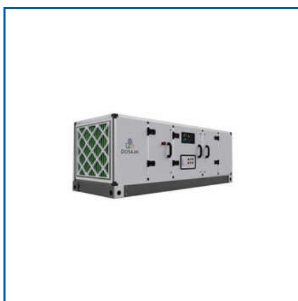
INDUSTRIAL AIR HANDLING UNIT