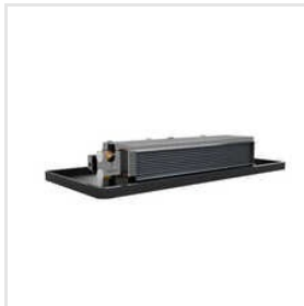
Ducted Fan Coil Unit