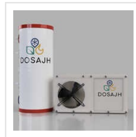
Commercial Swimming Pool Heat