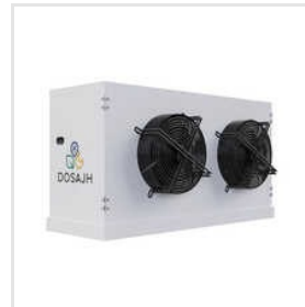
MS Cold Room Unit