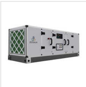
Industrial Air Handling Unit