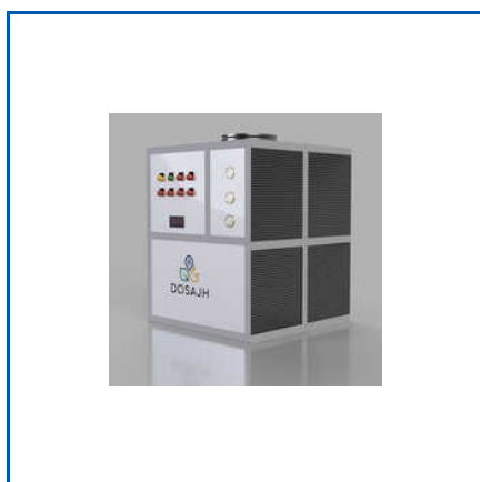
INDUSTRIAL AIR COOLED CHILLER

Cold Storage Chamber, Commercial Swimming Pool Heat Pump, Double Skin Air Handling Unit, Ducted Fan Coil Unit, Indoor Cold Room Unit, Industrial Air Cooled Chiller, Industrial Air Handling Unit, Industrial Blast Freezer, Industrial Cold Storage Room, Industrial Swimming Pool Heat Pump, MS Cold Room Unit, Mild Steel Industrial Swimming Pool Heat Pump, Residential Swimming Pool Heat Pump, etc.