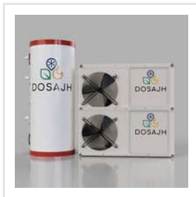
Industrial Swimming Pool Heat Pump