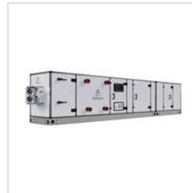
Double Skin Air Handling Unit