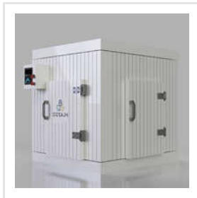
Industrial Cold Storage Room