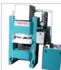
Hydraulic Coin Press Machine