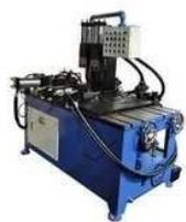
Special Purpose Hydraulic Press