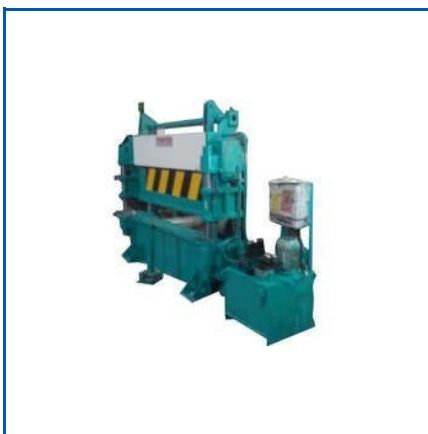
PILLAR PRESS BREAK MACHINES

4 Pillar Hydraulic Cutlery Press, 4 Pillar Type Hydraulic Embossing Press, 4 Pillar Type Hydraulic Sheet Bending Press, Automatic Hydraulic Baling Press, Automatic Hydraulic Cutting Machine, Automatic Hydraulic Rubber Moulding Press, Automatic Hydraulic Stamping Machine, Automatic Hydraulic Transfer Moulding Press, Break Bending Machine, C Frame Machine, C Type Hydraulic Press, CNC Press Brake Machine, Center Hole Cutting Machine, Continuous Baling Machine, Cooker Manufacturing Deep Draw Press, etc.