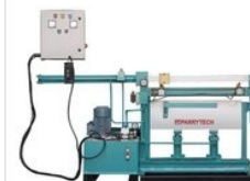
Hydraulic Argon Welding Machine