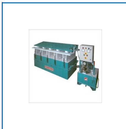
INDUSTRIAL PRESS BREAK MACHINE