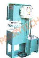
Hydraulic C Press