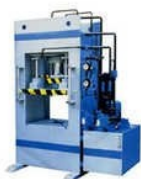
Double Action Hydraulic Press