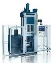
Hydraulic Sintering Press