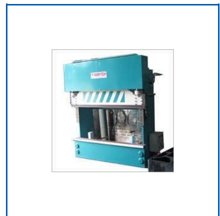
HYDRAULIC PRESS BRAKE MACHINE