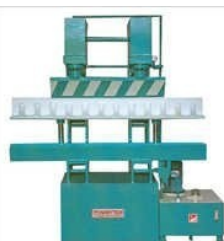
CNC Press Brake Machine