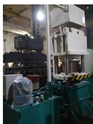
Hydraulic Cutlery Machine