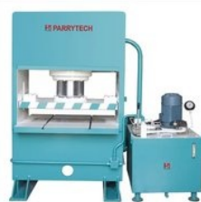
Cooking Hob Drawing Machine