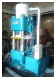
Four Pillar Hydraulic Press