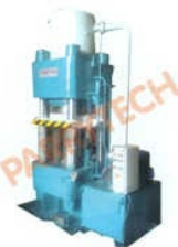
4 Pillar Type Hydraulic Embossing Press