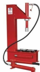
C Type Hydraulic Press