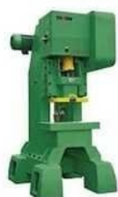
C Frame Machine