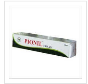
25 Gm PIONIL Cream