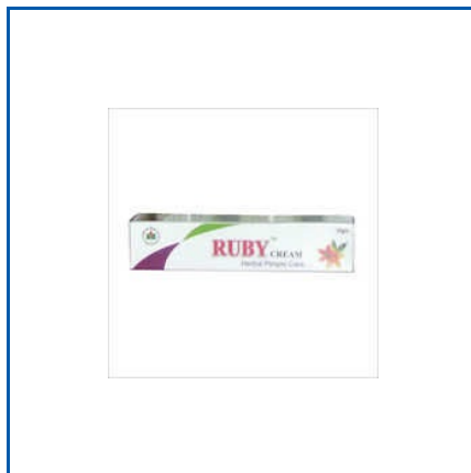
25GM RUBY HERBAL PIMPLE CARE