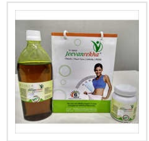
Obesity Management Basic Kit