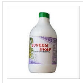
1500 PPM Suneem Drop Azadirachtin