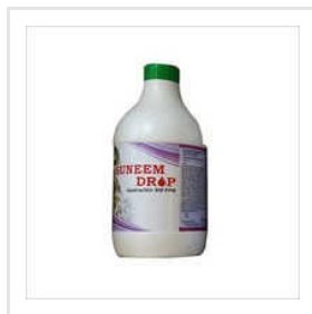
300 PPM Suneem Drop Azadirachtin