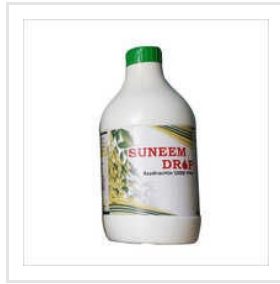
50000 PPM Suneem Drop Azadirachtin