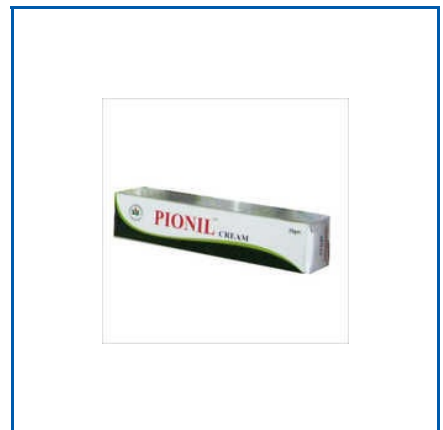
25 GM PIONIL CREAM