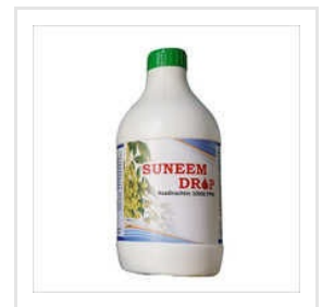
10000 PPM Suneem Drop Azadirachtin