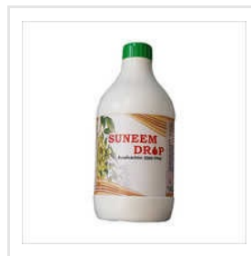
3000 PPM Suneem Drop Azadirachtin