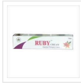
25gm Ruby Herbal Pimple Care