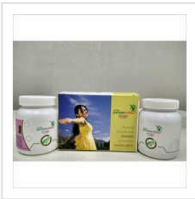
Jeevanrekha PCOD KIT