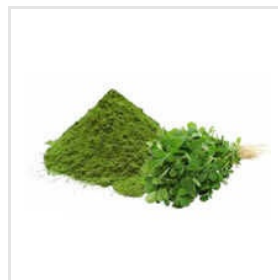
Fenugreek Leaf Powder