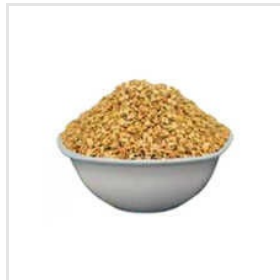
Garlic Minced 1-3mm