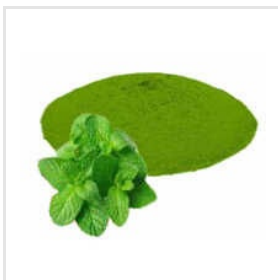
Mint Leaf Powder