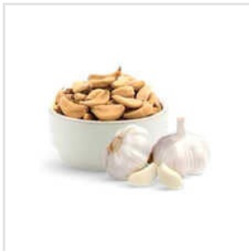
Garlic Flakes 10-15mm