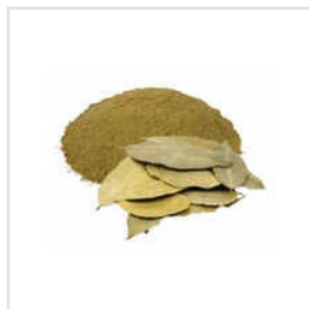
Bay Leaf Powder