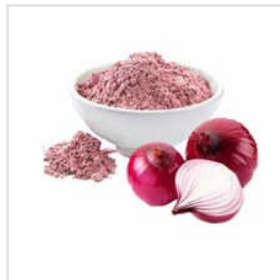
Red Onion Powder