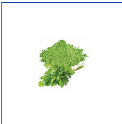
CORIANDER LEAF POWDER