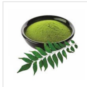
Curry Leaf Powder