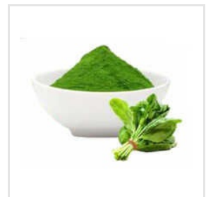
Spinach Leaf Powder