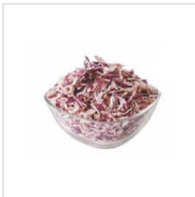
Red Onion Flakes 10-15mm