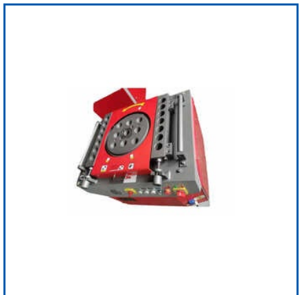
GW58 BAR BENDING MACHINE