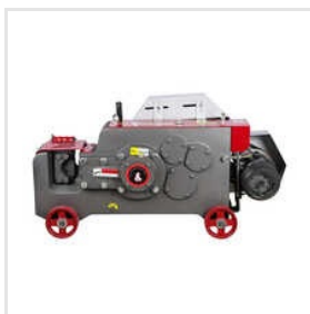
Fully Automatic Bar Cutting Machine