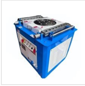
Automatic Bar Bending Machine