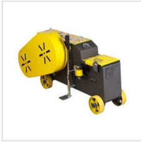
UNI 50C Bar Cutter Machine