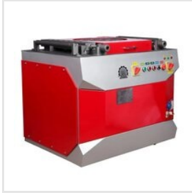
Steel Bar Bending Machine