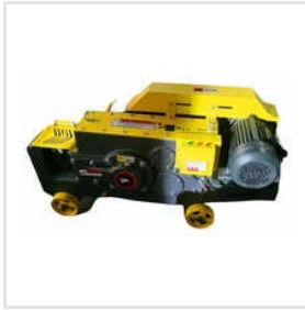
GQ50 Rebar Cutter Machine