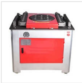
Bar Bending Bar Cutting Machine