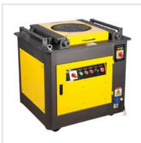
Gw45 Automatic Bar Bending Machine