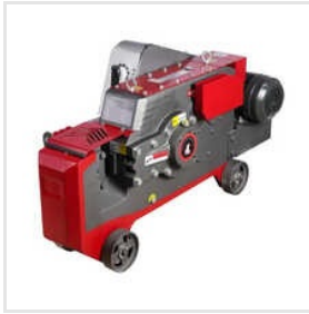
Rebar Cutting Machine