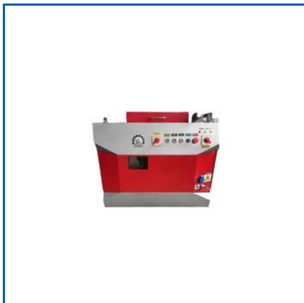
GW 50 BAR BENDING MACHINE