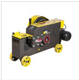
40mm Rebar Cutter Machine