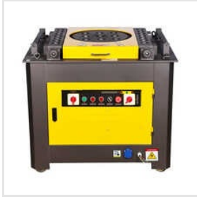
FM 42 Bar Bending Machine