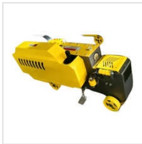
Automatic Steel Bar Cutting Machine