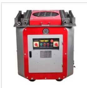
Gw 42 Bar Bending Machine