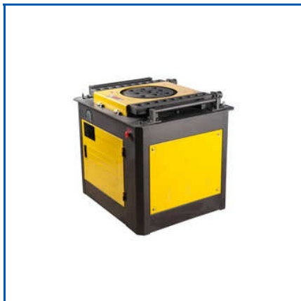
AUTOMATIC BAR BENDING MACHINE

32mm Rebar Cutting Machine, 40mm Bar Cutter Machine, 40mm Rebar Cutter Machine, 45 HP Ride on Roller, 5 Ton Ride On Roller, Automatic Bar Bending Machine, Automatic Rebar Bender, Automatic Steel Bar Cutting Machine, Automatic Steel Stirrup Bending Machine, Bar Bending Bar Cutting Machine, Bar Bending Machine, Bar Ring Making Machine, Bar Straightening Machine, Digital Stirrup Bending Machine, Double Drum Ride On Roller, etc.