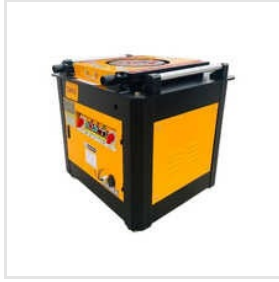
Bar Bending Machine