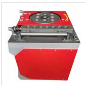
Gw40 Automatic Bar Bending Machine