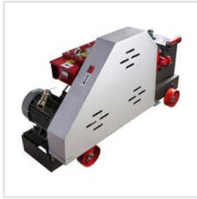
Electric Bar Cutter Machine