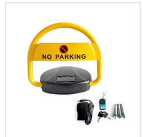
Automatic Parking Space Lock