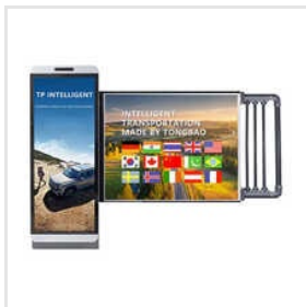
Advertising Barrier Gate With LED Screen