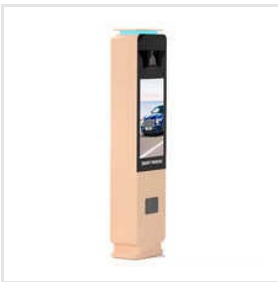
Traffic Barriers License Plate Recognition