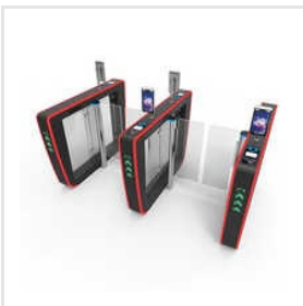
Face Recognition Terminal For Barrier