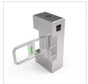
Pedestrian Swing Flap Barrier