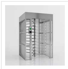
OEM High Quality Professional Full Height