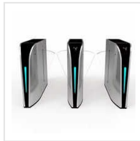
TP Intelligent Automatic Flipping