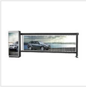
Commerical Usage Advertise Barrier Gate