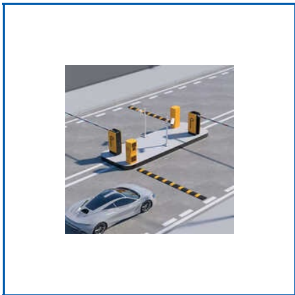
TP VEHICLE PARKING LICENSE PLATE RECOGNITION