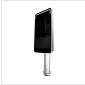
Facial Recognition Device