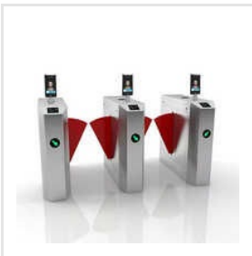
TP Fingerprint Access Control Flap Barrier