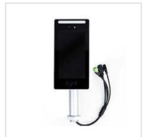
Face Attendance WIFI Remote Control