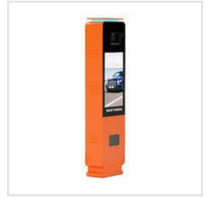
Automatic Gate Parking License Plate