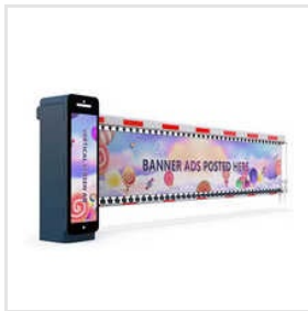
Automatic Intelligent Advertising Fence