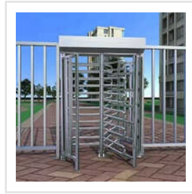
Automatic Barrier Gate Turnstile