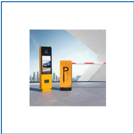
AUTOMATIC PARKING LICENSE PLATE RECOGNITION

180 Degree Parking Lock, Ac Motor Sliding Gate Opener, Access Control Flap Barrier, Access Control Tripod Turnstile, Adjustable DC Parking Barrier Boom Gate, Advertising Automatic Barrier Gate, Advertising Barrier Gate With LED Screen, Anti-Collision Swing Turnstile Pedestrian Barrier Gate, Anti-Collision Turnstile Gate, Anti-Parking Lock, Anti-Terror Protection Steel Hydraulic Lifting Bollard, Attendance Punching Device, Automatic Advertise Barrier Gate, Automatic Barrier Gate Turnstile, Automatic Boom RFID Barrier Gate, etc.