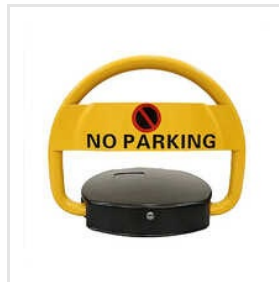
TP Anti Collision Parking Auto Lock