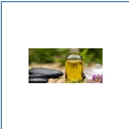
BP CASTOR OIL

12-Hydroxy Stearic Acid, BP Castor Oil, Blown Castor Oil, Castor Oil, Castor Oil Derivatives, Castor Oil Esters, Castor Oil Ethoxylate, Castor Oil For Agriculture, Castor Oil For Electronic, Castor Oil Paints, Castor Oil for Cosmetics, Castor Oil for Industrial Lubricants, Castor Oil for Lipstick & Face Cream, Castor Oil for Perfumeries, Castor Oil for Textile Chemicals, etc.