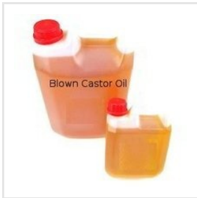
Blown Castor Oil