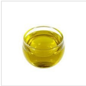
Castor Oil Ethoxylate