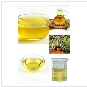
12-Hydroxy Stearic Acid