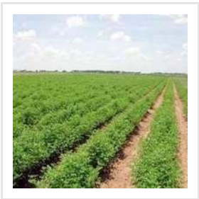
Hybrid Castor Seeds