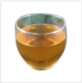
Sulfated Castor Oil