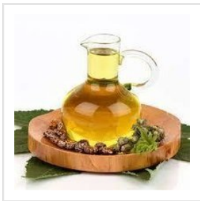
Hydrogenated Castor Oil