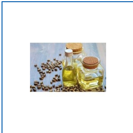
ETHOXYLATED CASTOR OIL