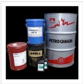
Industrial Grade Castor Oil