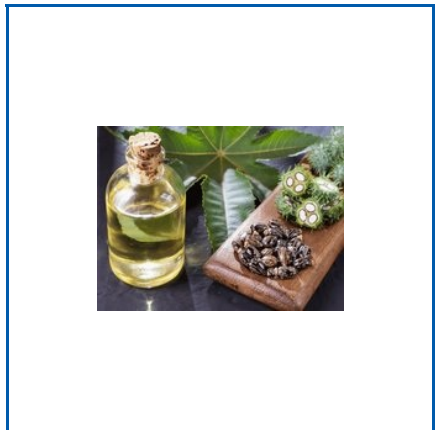
PURE CASTOR OIL