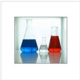
Castor Oil For Textile Chemicals