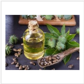
Castor Seed Oil