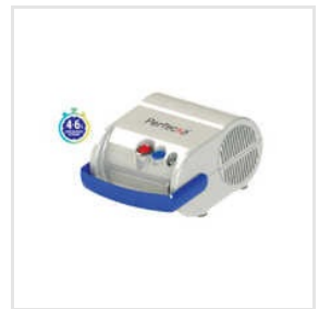
Piston Compressor Nebulizer