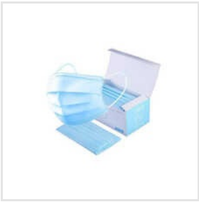
3 Ply Face Mask