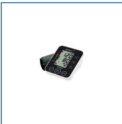
DIGITAL BP MACHINE

10 Meter Oxygen Nasal Cannula, 10 Meter Oxygen Tube, 12 Channel ECG Machine, 1200 Multi Para Monitor, 2 Blade Neo Laryngoscope Set, 2 Fold Aluminium Stretcher, 25cm Retinoscope, 3 Ball Respirometer, 3 Balls Lung Exercise, 3 Blade Child Laryngoscope Set, 3 Channel ECG, 3 In 1 Vapourizer Steamer, 3 Ply Face Mask, 4 Blade Adult Laryngoscope Set, 5kg Manual Baby Scale, etc.