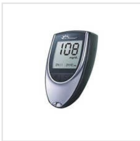
BG-03 Gluco One Glucometer