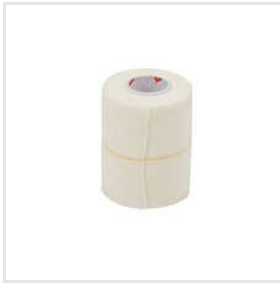
Elastic Adhesive Bandage