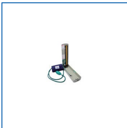
MANUAL BP MACHINE