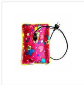
Electric Warm Gel Bag