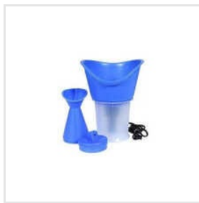
3 In 1 Vapourizer Steamer