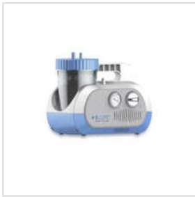
Portable Suction Machine